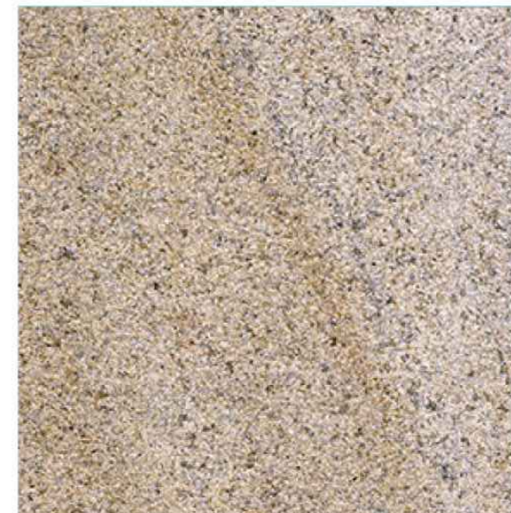
Honey Jasper Granite