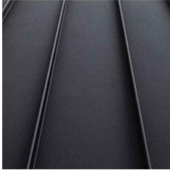
Powder Coat Steel Finish: Monument Gray Steel