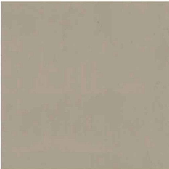
CCS Lychee Concrete