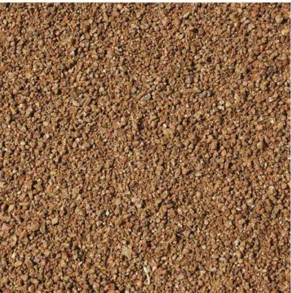
Ginninderra Decomposed Granite