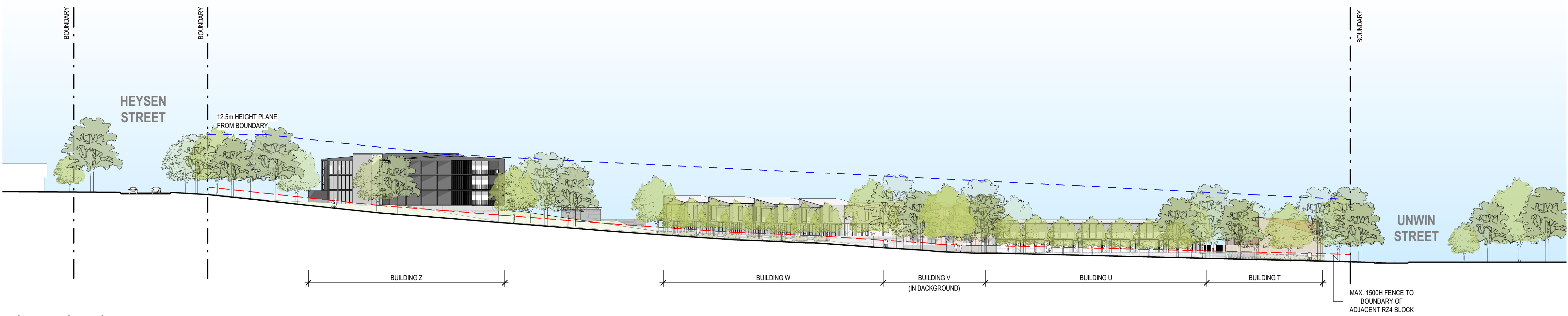
EAST ELEVATION - B7 S96