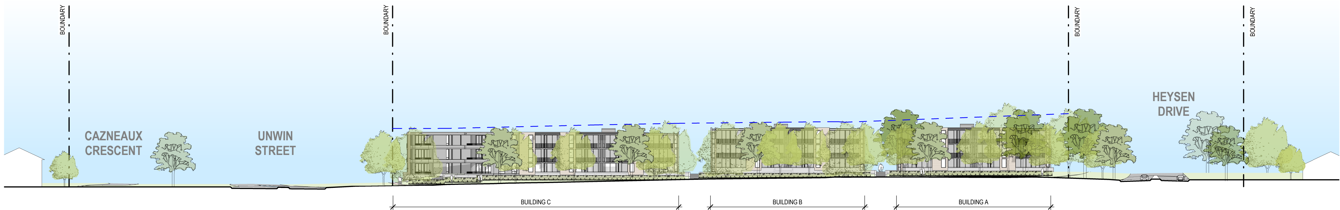
WEST ELEVATION - STREETON DRIVE