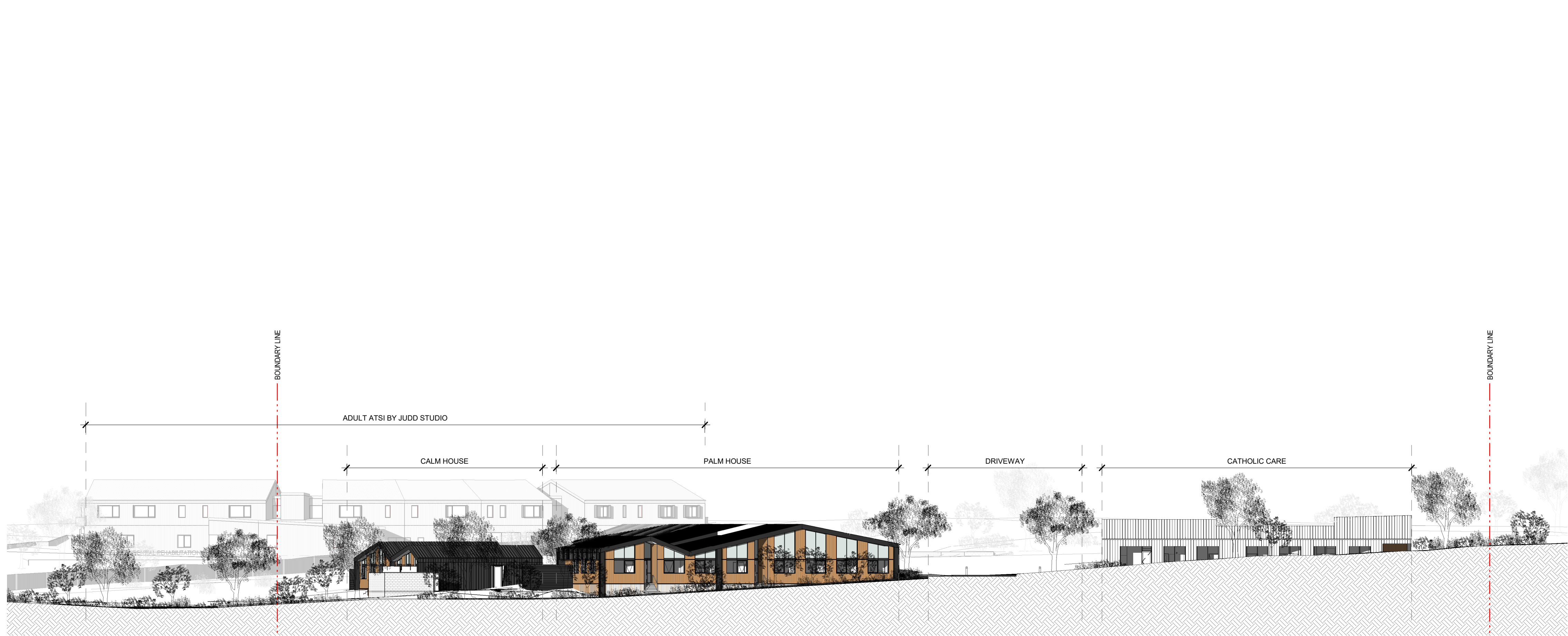
1 STREETSCAPE SOUTH ELEVATION FROM DRIVEWAY SCALE: 1 : 300