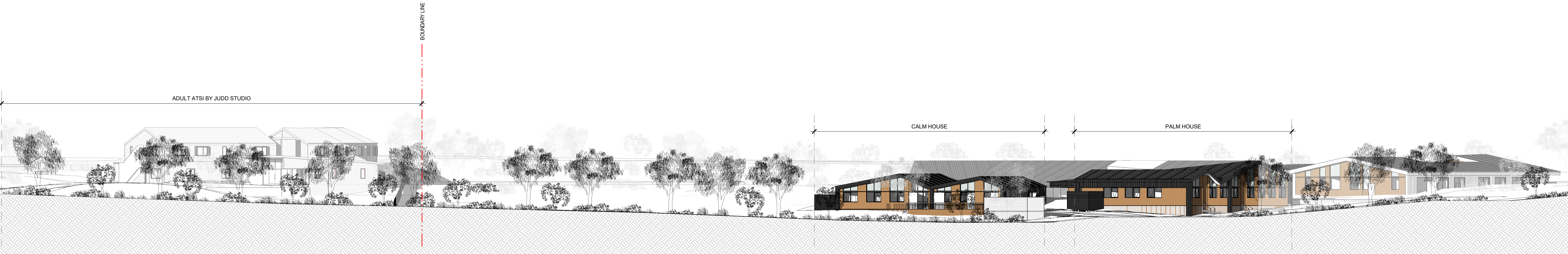
2 STREETSCAPE EAST ELEVATION FROM ANTILL STREET SCALE: 1 : 300