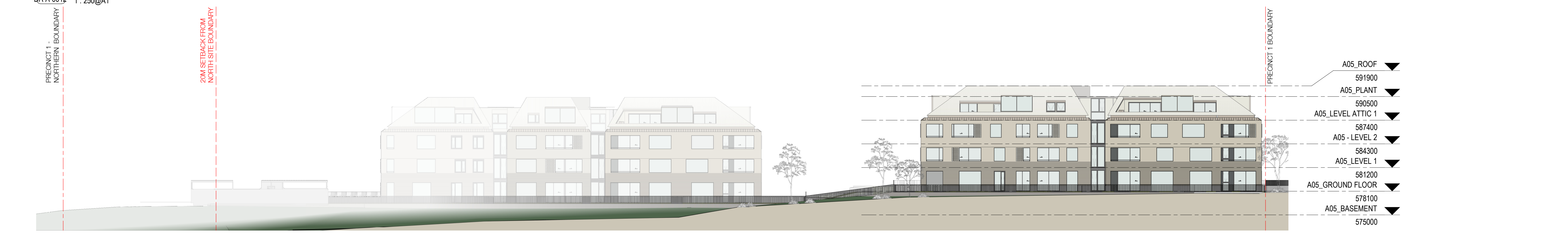
4 PRECINCT 1 - ELEVATION WEST DA-A-0012 1: 250@A1

Nominated Architects: Adam Haddow-7188 | John Pradel-7004