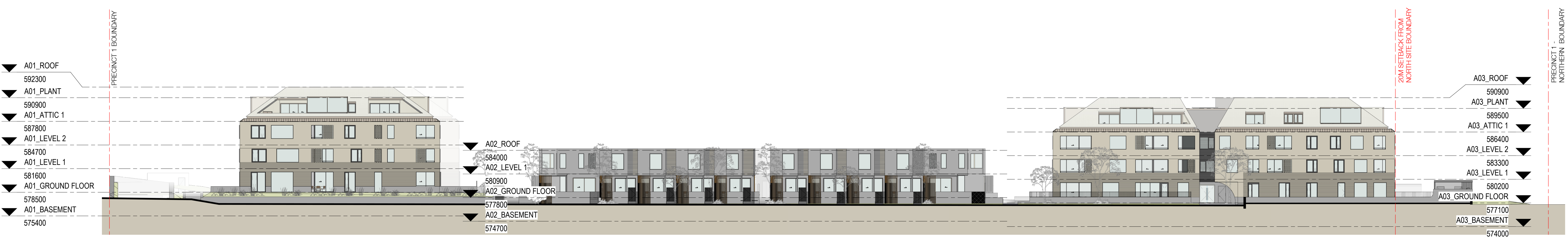
2 PRECINCT 1 - ELEVATION EAST DA-A-0012 1: 250@A1