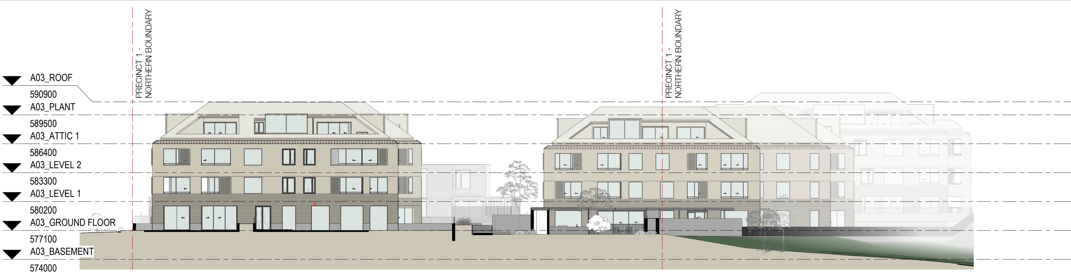
1 PRECINCT 1 - ELEVATION NORTH DA-A-0012 1: 250@A1