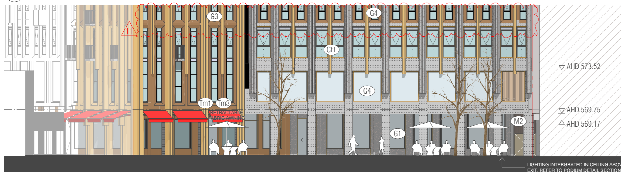
02 PODIUM ELEVATION - SOUTH SCALE 1:200@A3