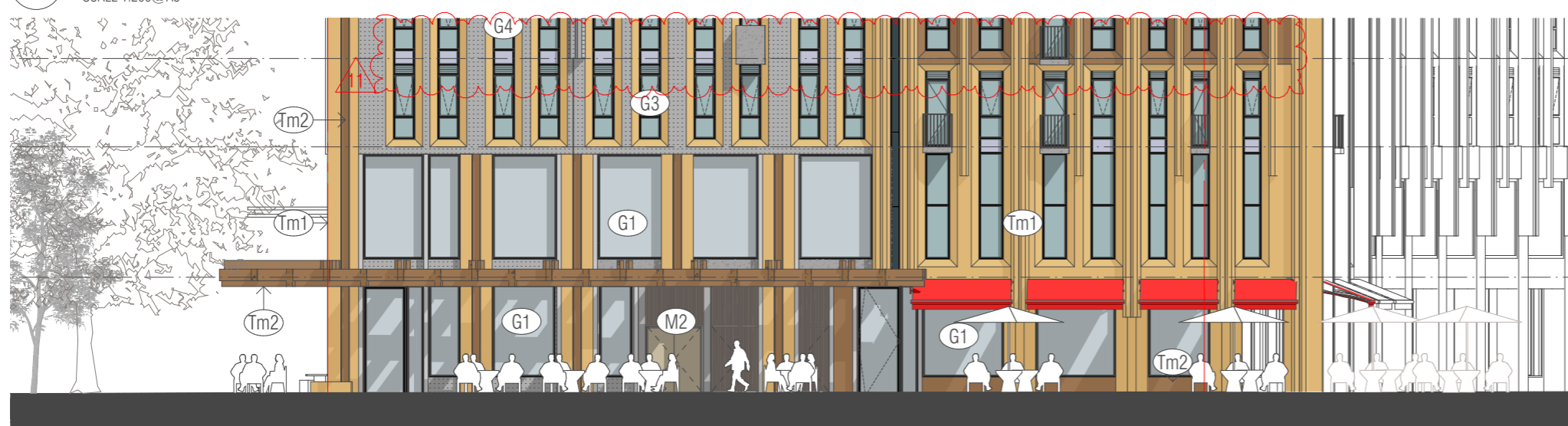
03 PODIUM ELEVATION - WEST SCALE 1:200@A3