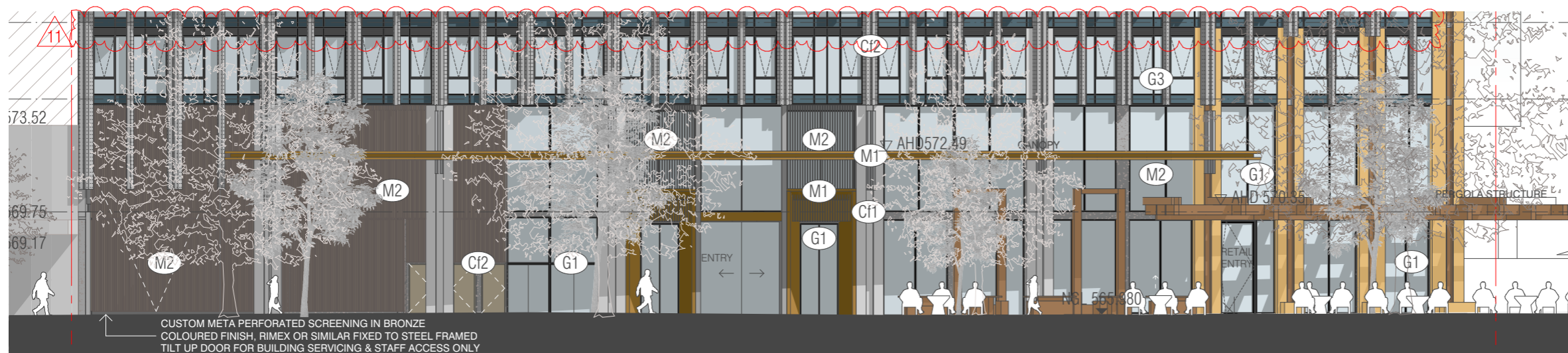
01 PODIUM ELEVATION - NORTH SCALE 1:200@A3