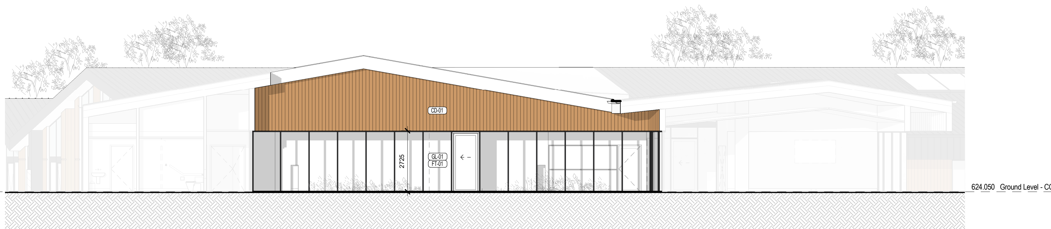
4 COURTYARD - WEST ELEVATION SCALE: 1:100