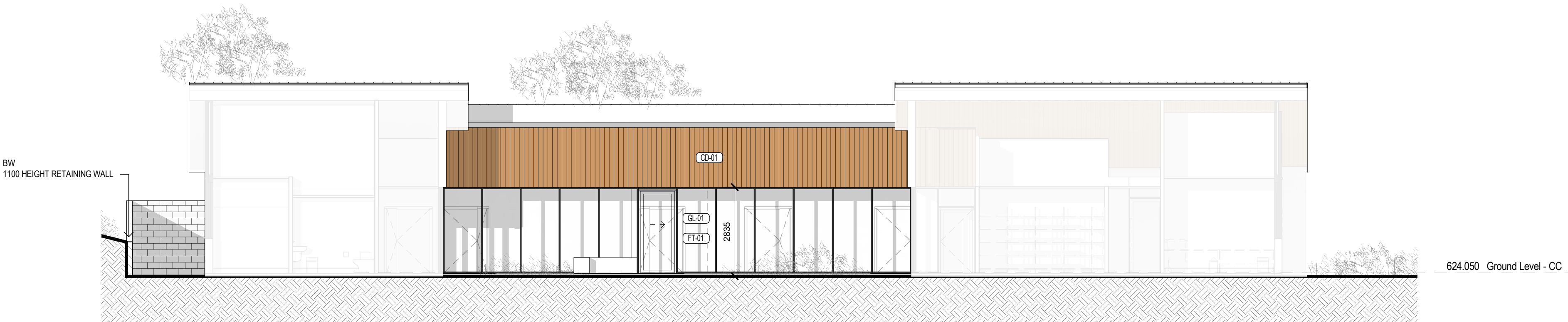
3 COURTYARD - SOUTH ELEVATION SCALE: 1:100