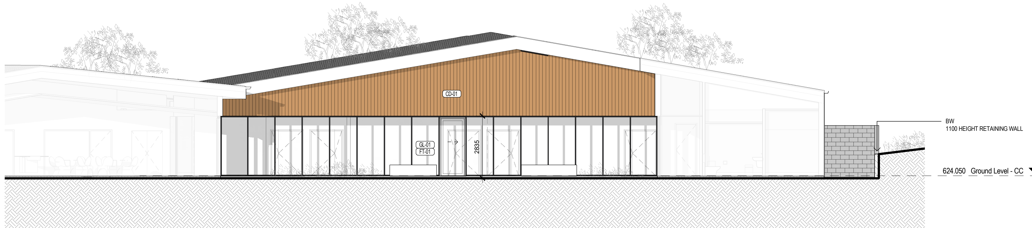
2 COURTYARD - EAST ELEVATION SCALE: 1:100