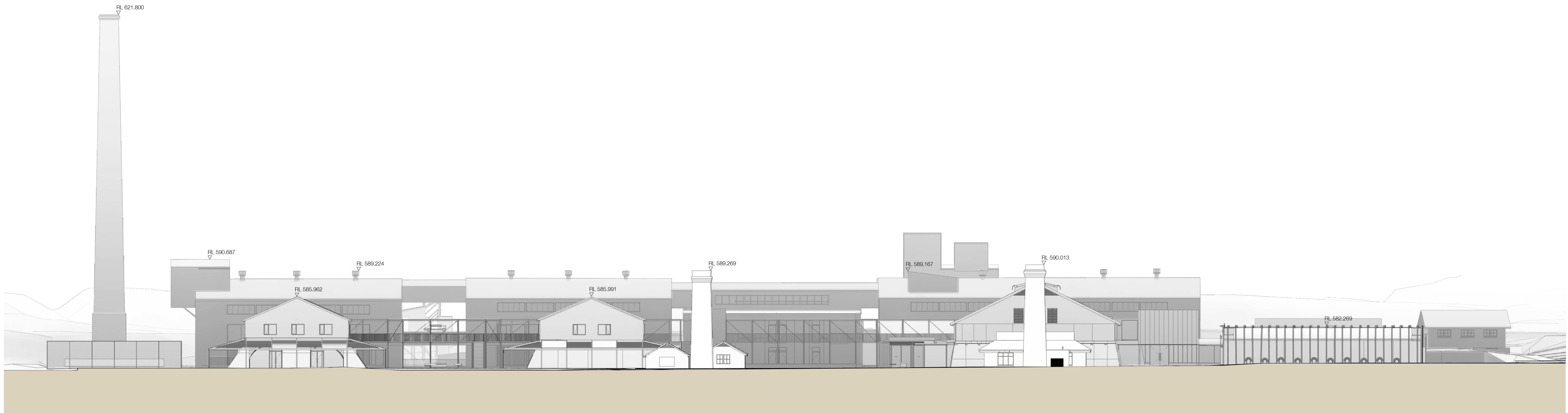
2 DA-H - Elevation West 1 : 250@A1