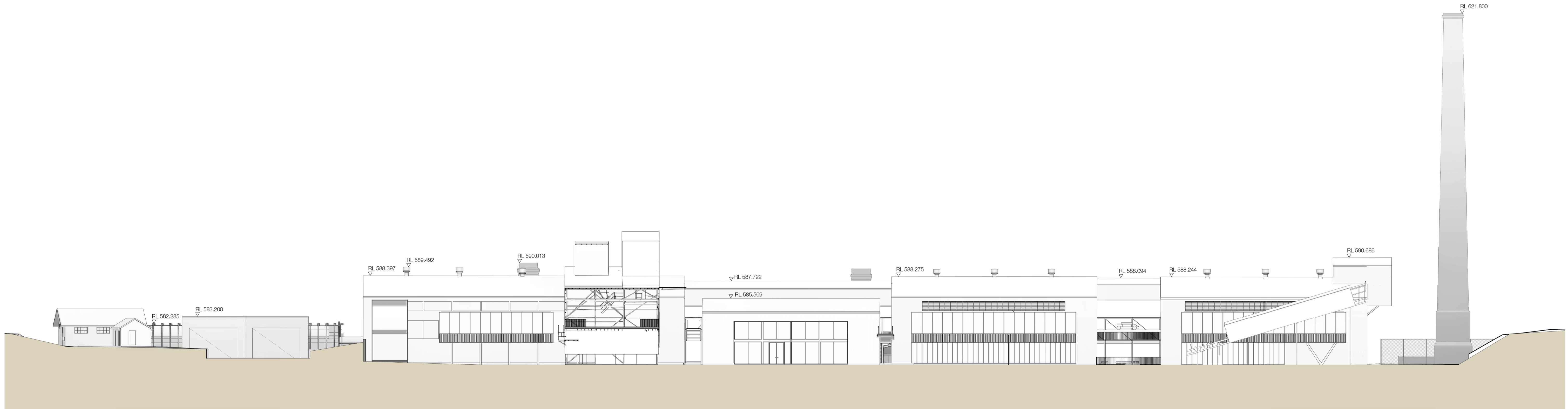
2 DA-H - Elevation East A-H14-0301 1 : 250@A1