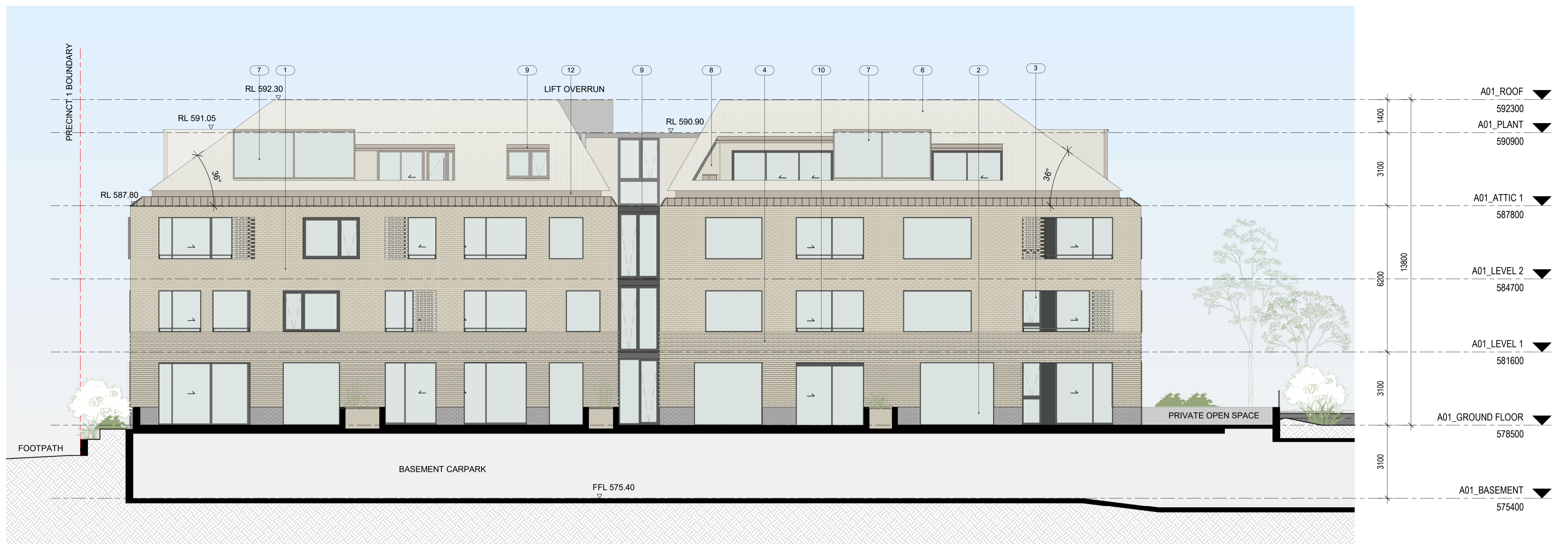
1 A01 - ELEVATION - NORTH DA-A-021 1: 100@A1