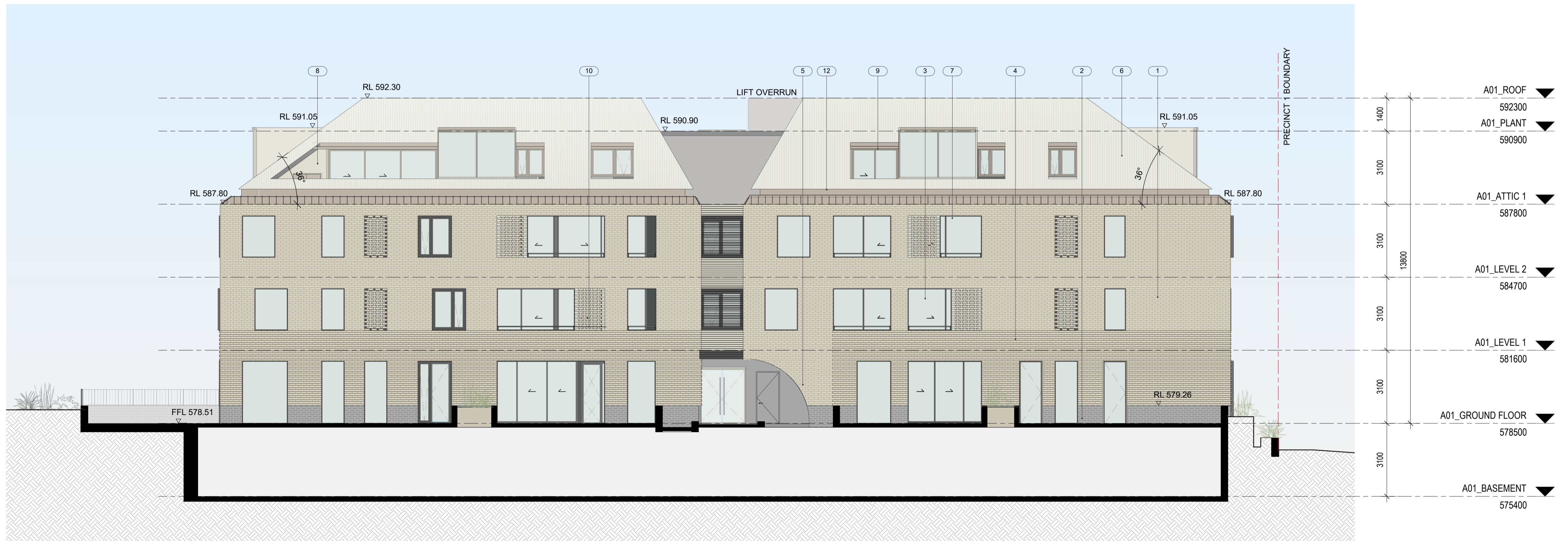
2 A01 - ELEVATION - SOUTH A-0-4401x 1: 100@A1