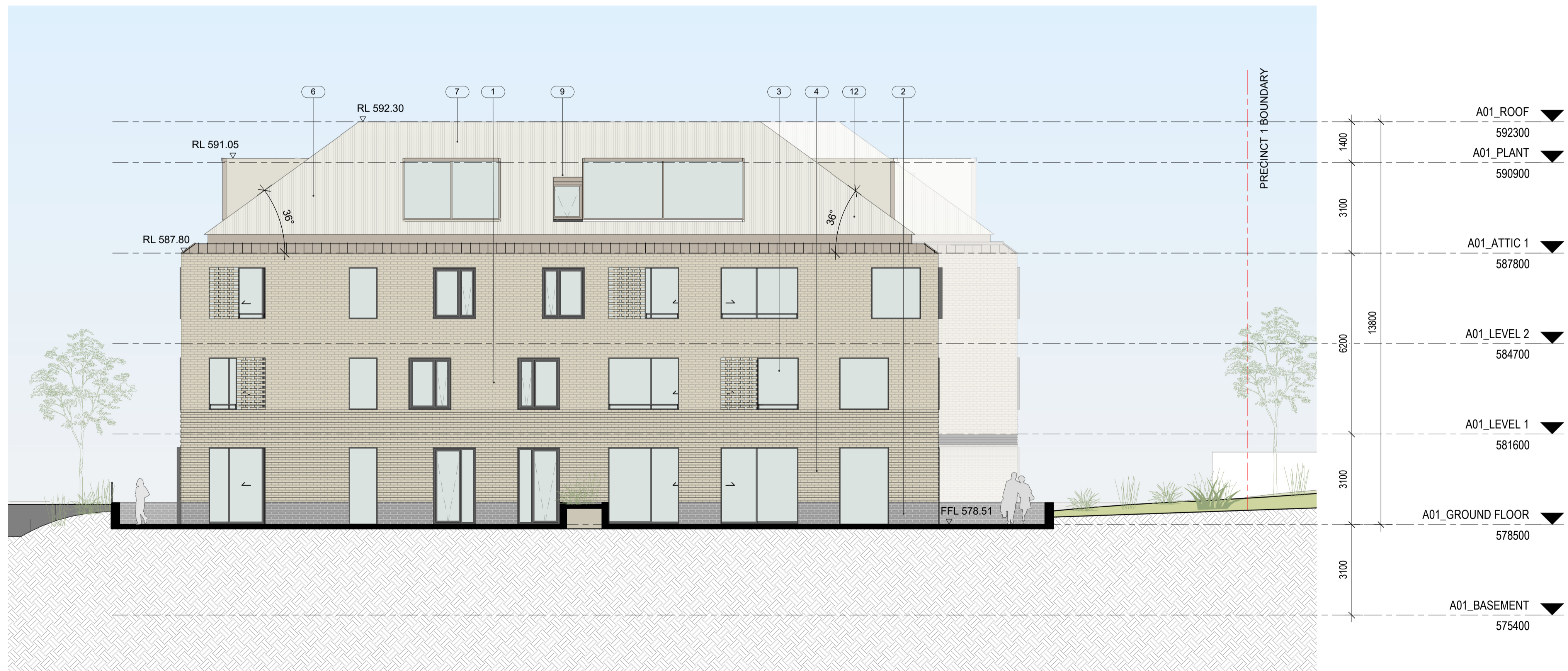
2 A01 - ELEVATION - WEST DA-A-0211 1:100@A1