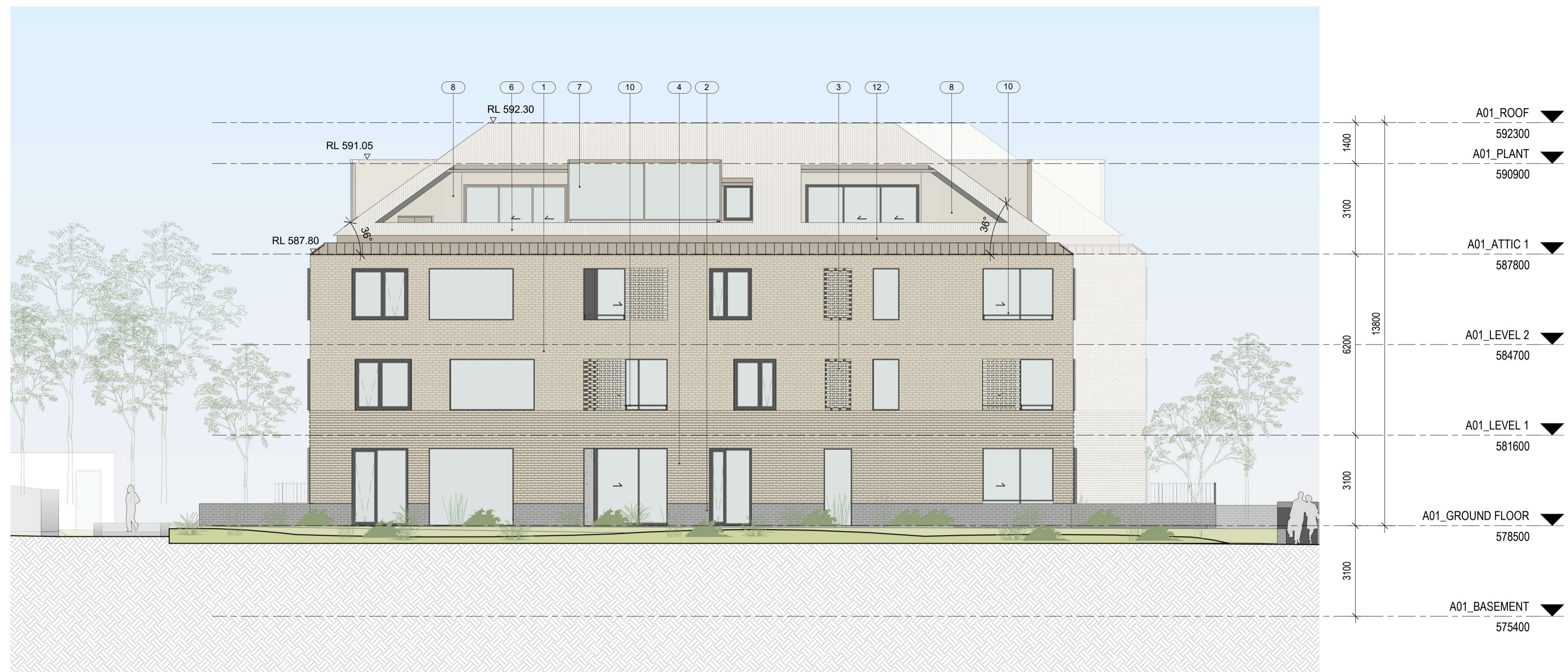
1 A01 - ELEVATION - EAST DA-A-0221 1:100@A1