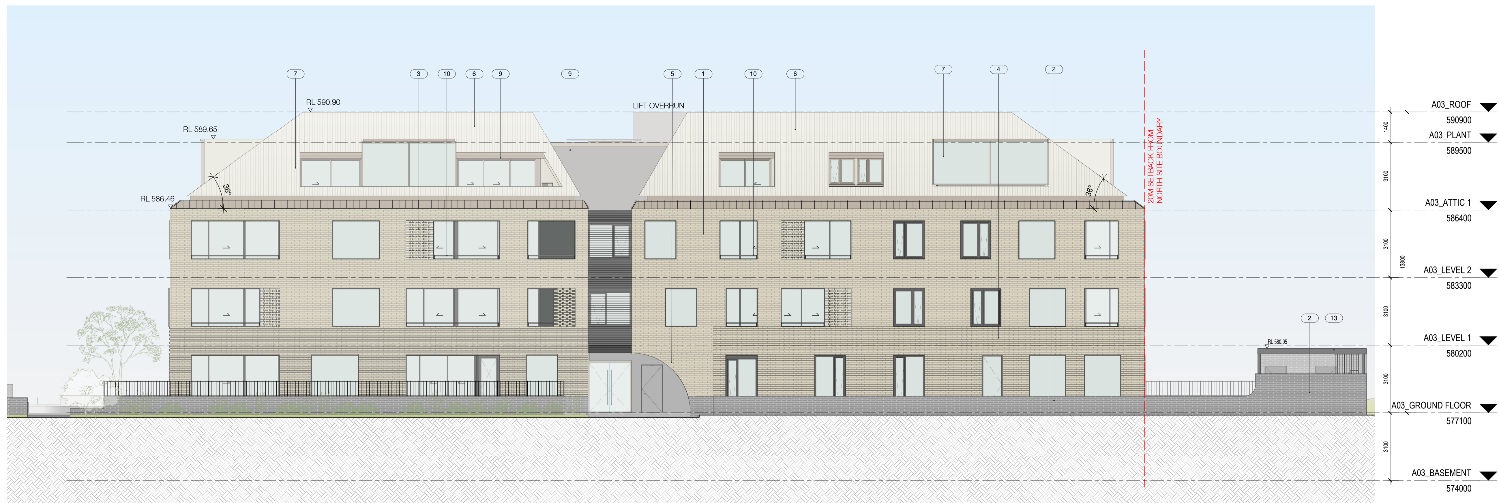
1 A03 - ELEVATION EAST A-0-4440x 1: 100@A1