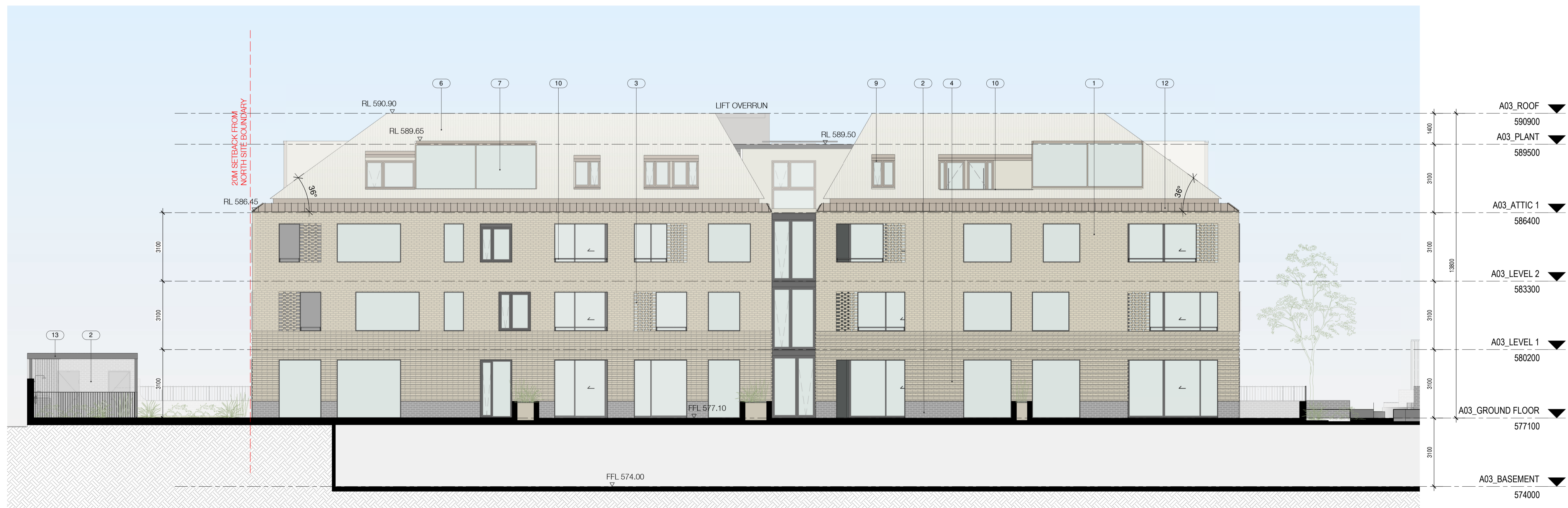
2 A03 - ELEVATION WEST A-0-4439x 1: 100@A1