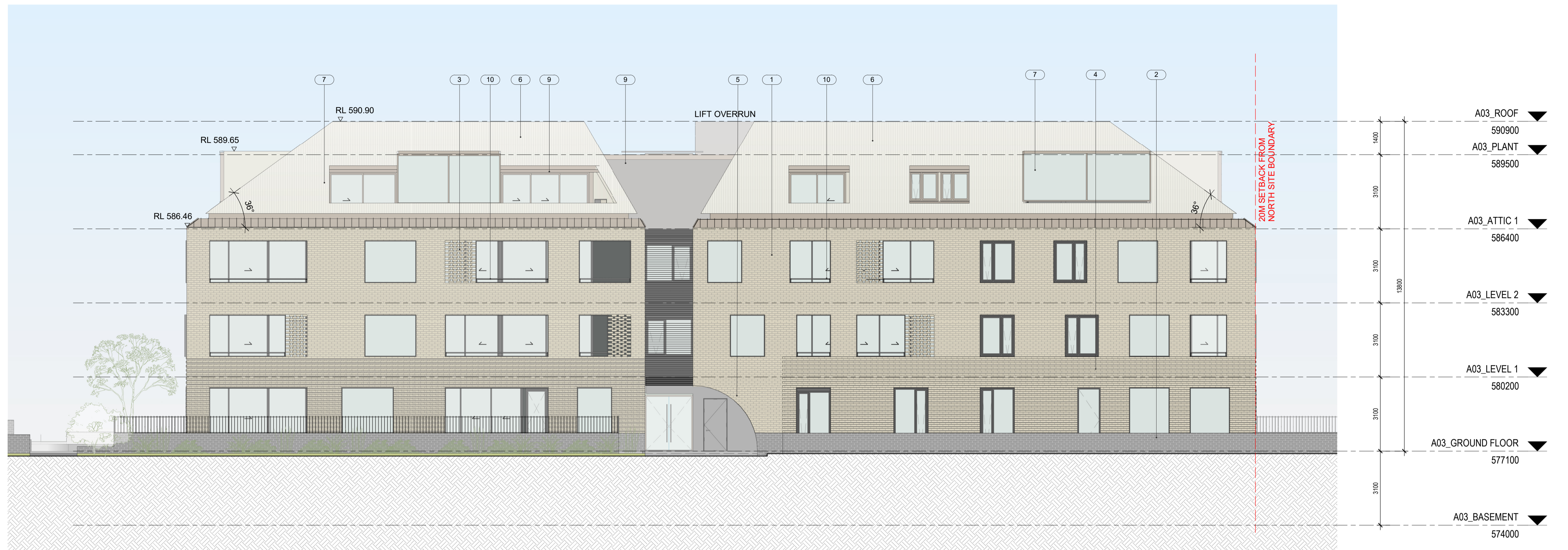
1 A03 - ELEVATION EAST A-0-4440x 1:100@A1