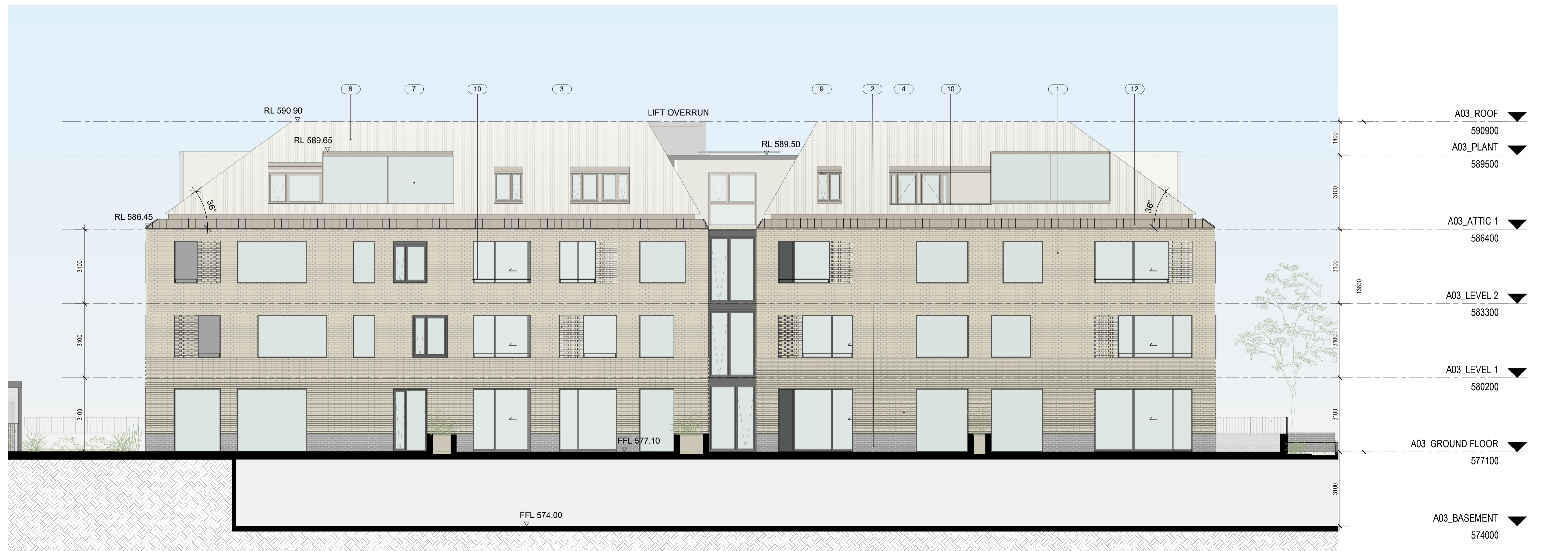
2 A03 - ELEVATION WEST A-0-4439x 1:100@A1