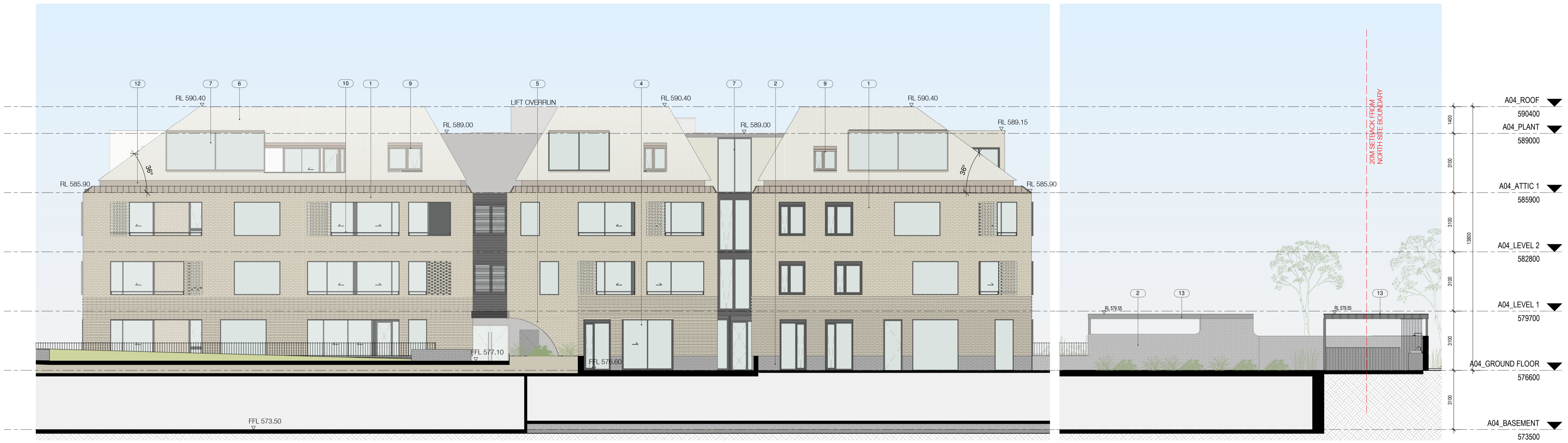
1 A04 - ELEVATION EAST A-0-4465 1: 100@A1