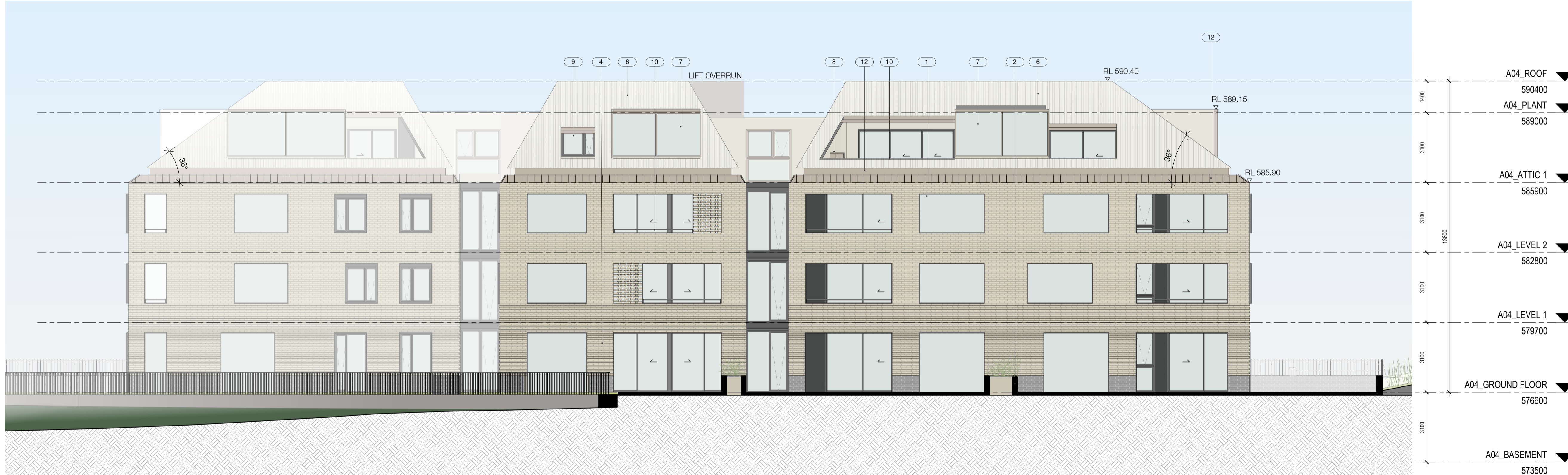
2 A04 - ELEVATION WEST DA-A-024 1: 100@A1