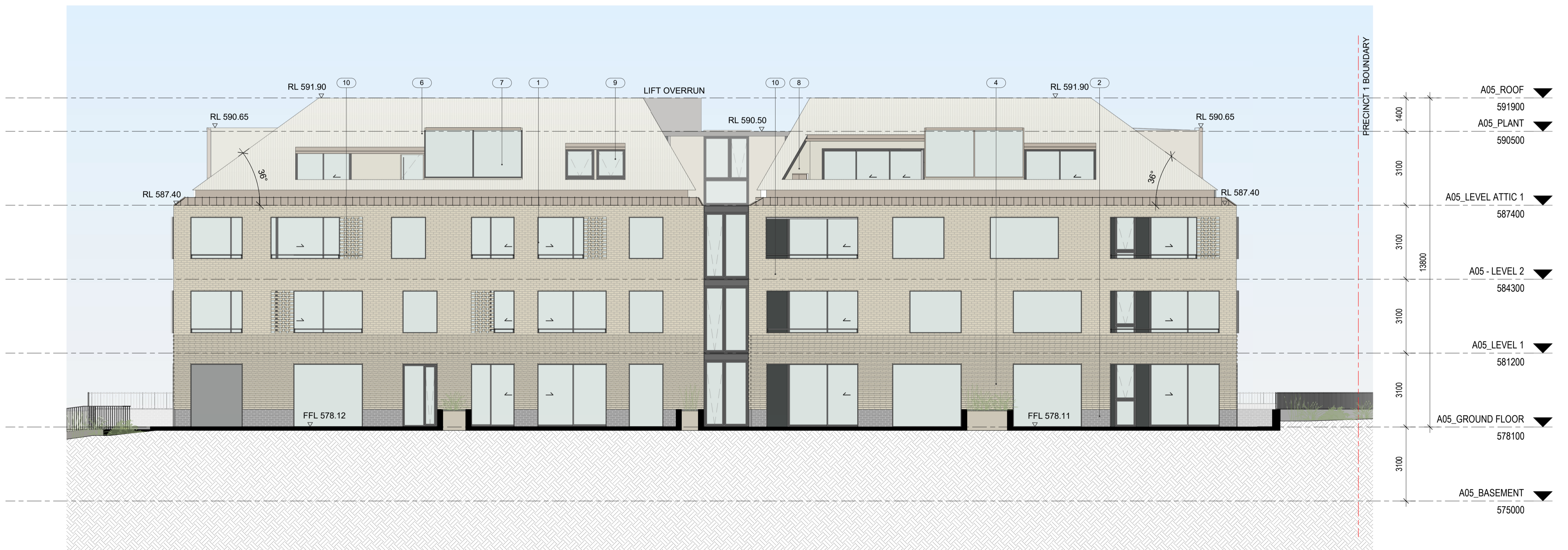
2 A05 - ELEVATION WEST A-0-4441 1: 100@A1