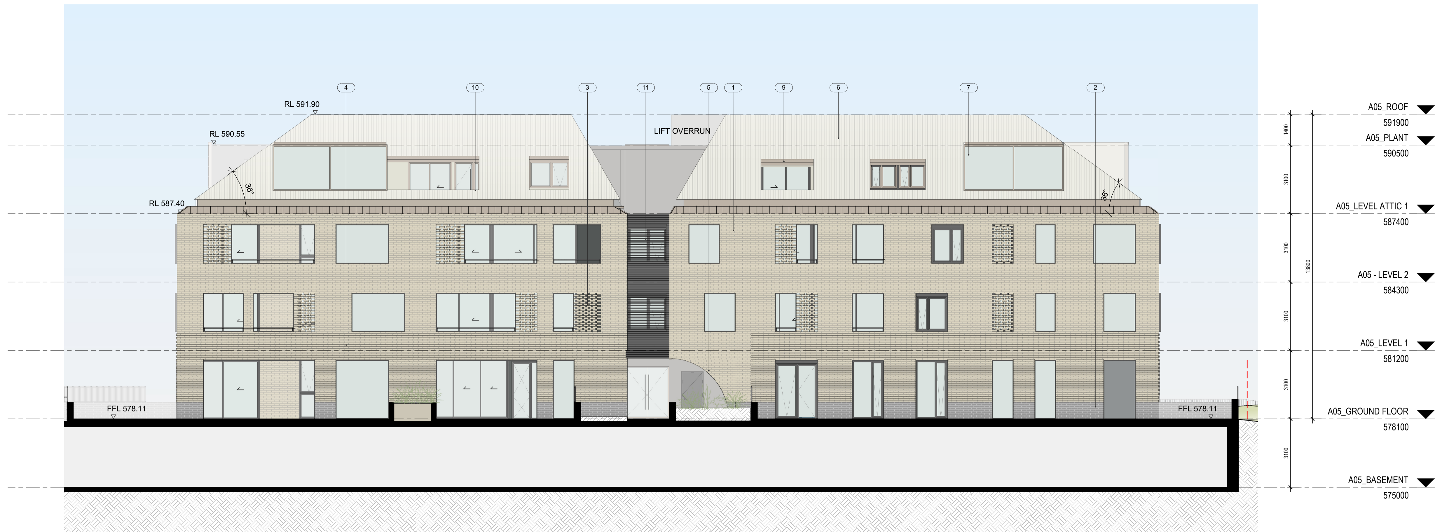
1 A05 - ELEVATION EAST A-0-4442 1: 100@A1