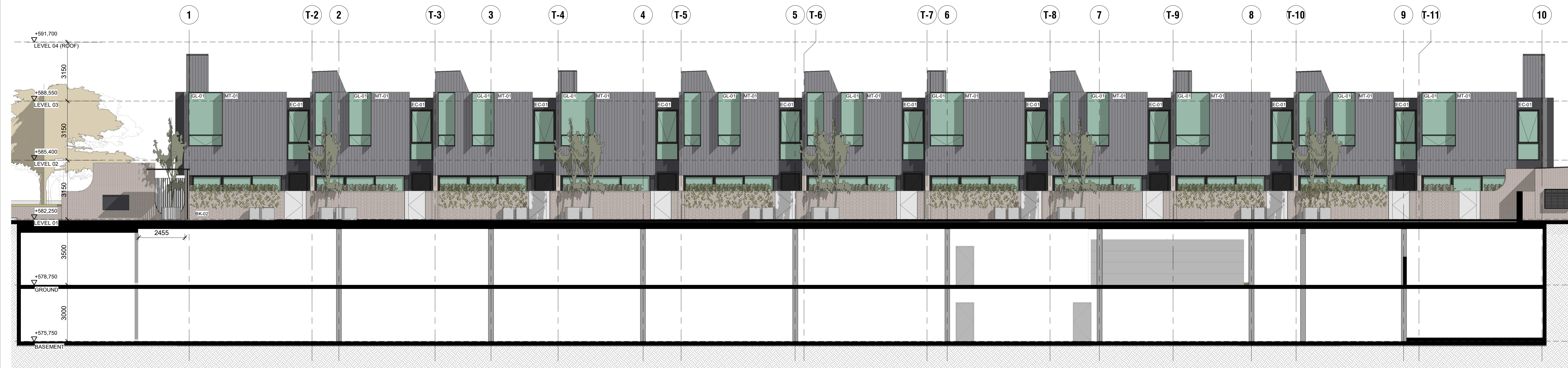
1 5 INTERNAL FACING NORTH ELE 1:100