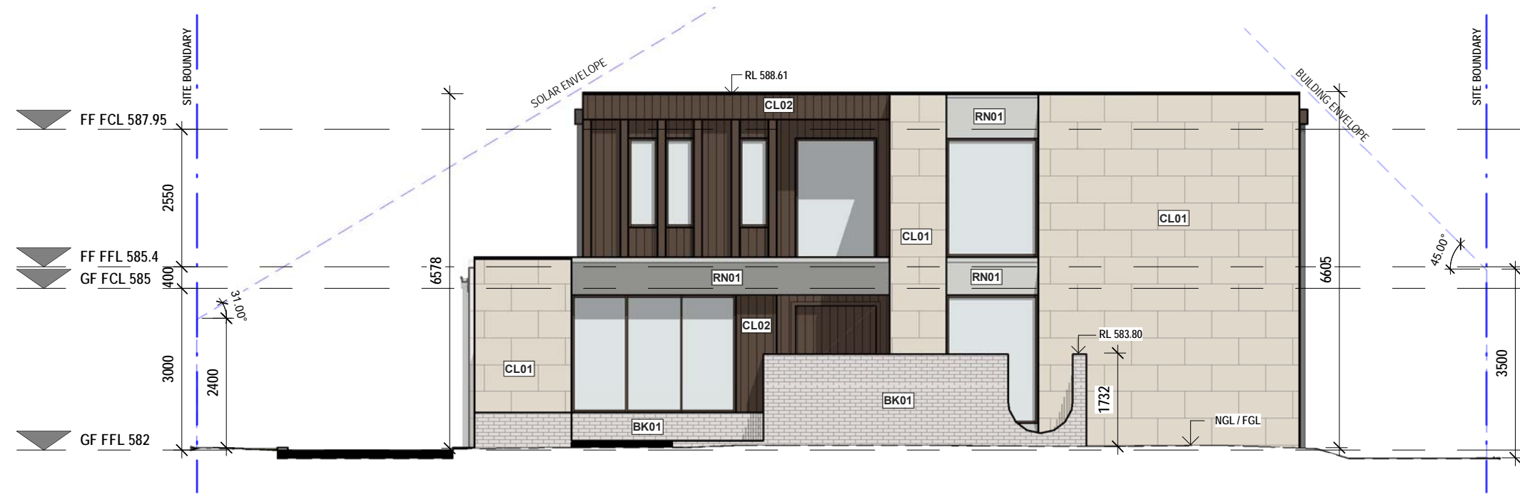
1 East 1:100

USE FIGURED DIMENSIONS AND DO NOT SCALE FF DRAWINGS. ALL DIMENSIONS AND LEVELS TO BE CHECKED AND VERIFIED ON SITE PRIOR TO COMMENCEMENT OF WORKS. ALL STANDARD OF WORKMANSHIP TO CONFORM TO ALL RELEVANT PARTS OF SPECIFICATION, AUSTRALIAN STANDARDS AND BCA/NCC. REPRODUCTION OF THIS DRAWING IN FULL OR PART WITHOUT THE WRITTEN PERMISSION OF THURSDAY ARCHITECTURE CONSTITUTES AN INFRINGEMENT OF COPYRIGHT.