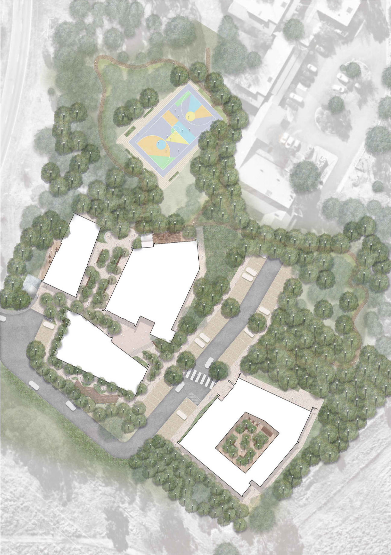
PROJECT RENDER - NTS