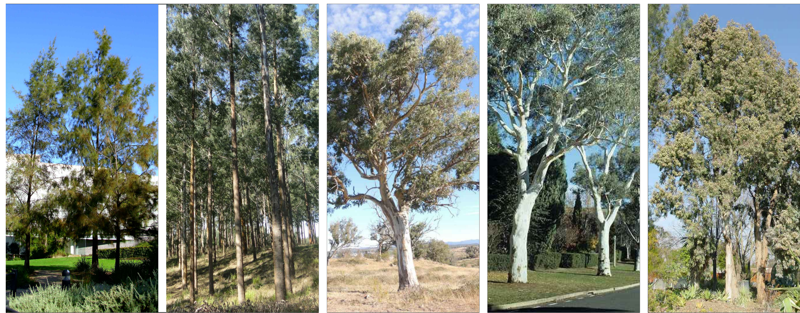
Casuarina cunninghamiana Eucalyptus benthamii Eucalyptus blakelyi Eucalyptus mannifera Eucalyptus polyanthemus