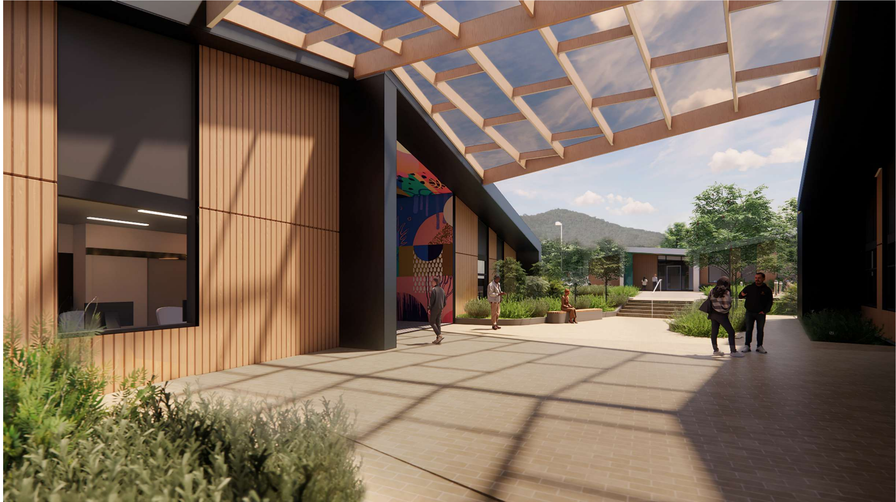
EXTERIOR PERSPECTIVE 1: CENTRAL 'STREET' TOWARDS CATHOLIC CARE