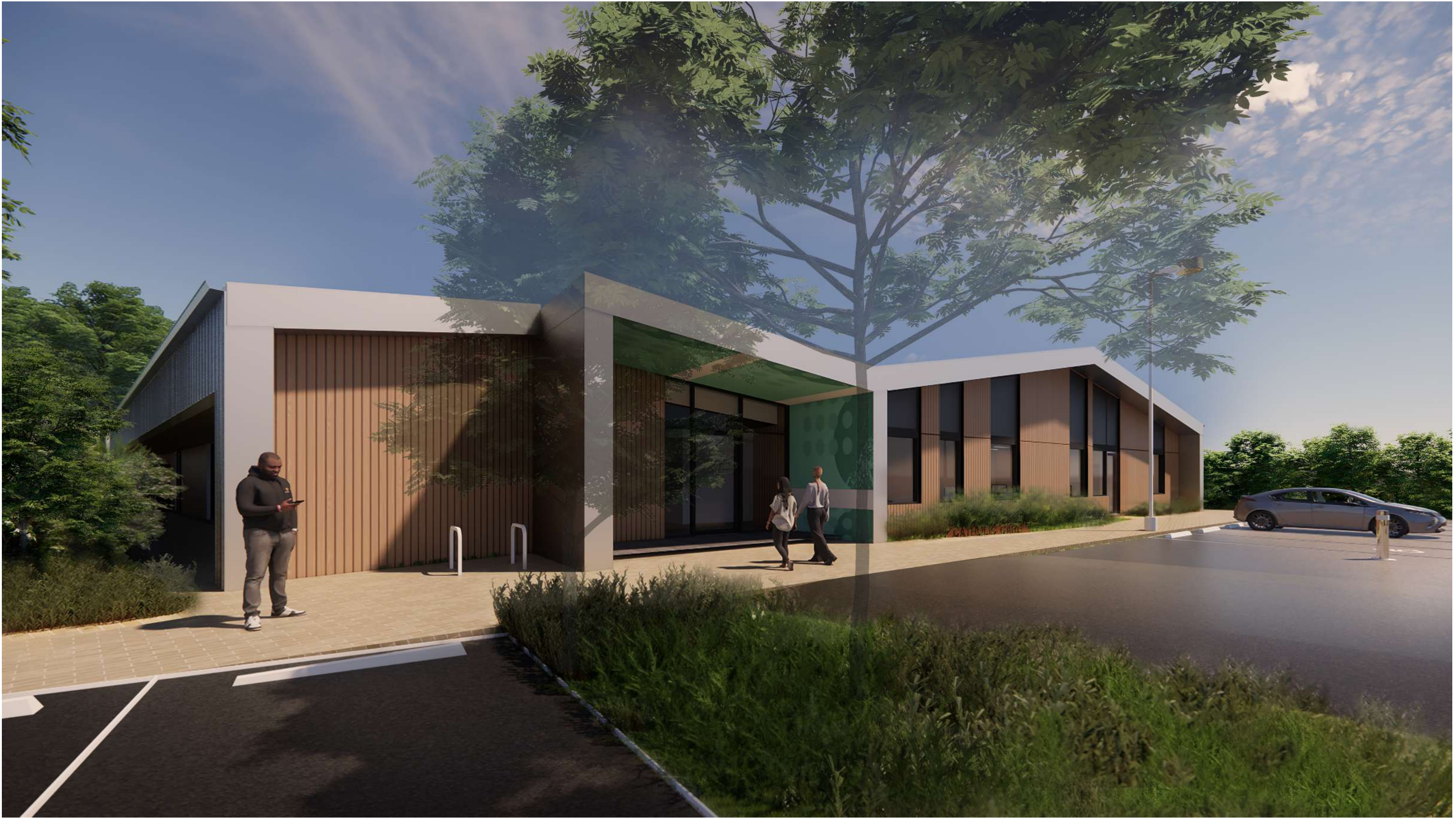
EXTERIOR PERSPECTIVE 2: CATHOLIC CARE ENTRY