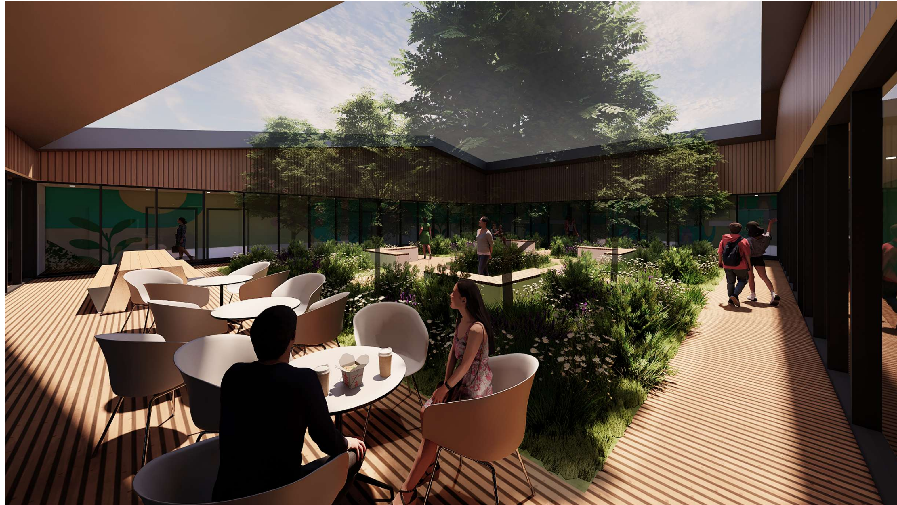
EXTERIOR PERSPECTIVE 1