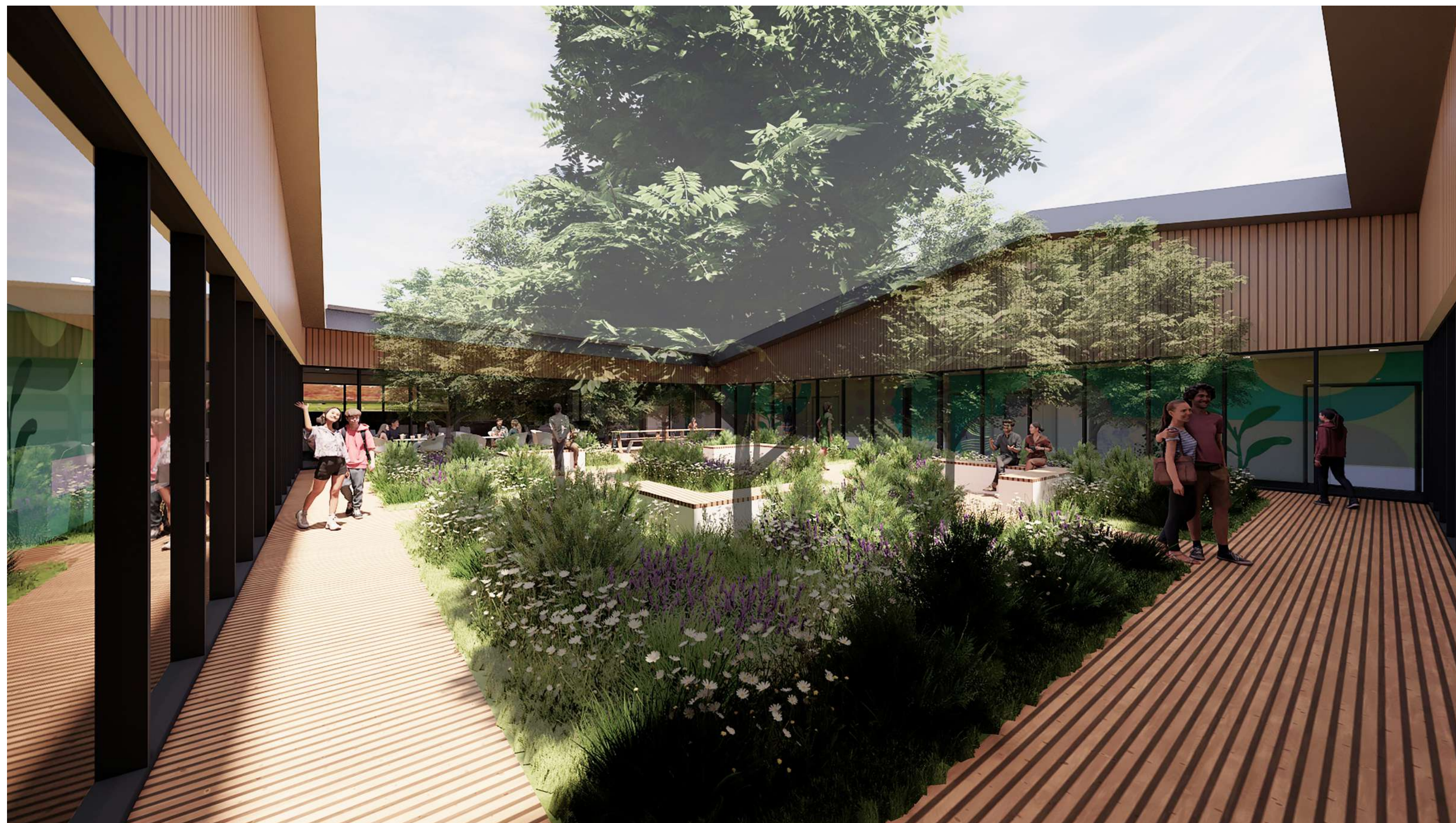
EXTERIOR PERSPECTIVE 2