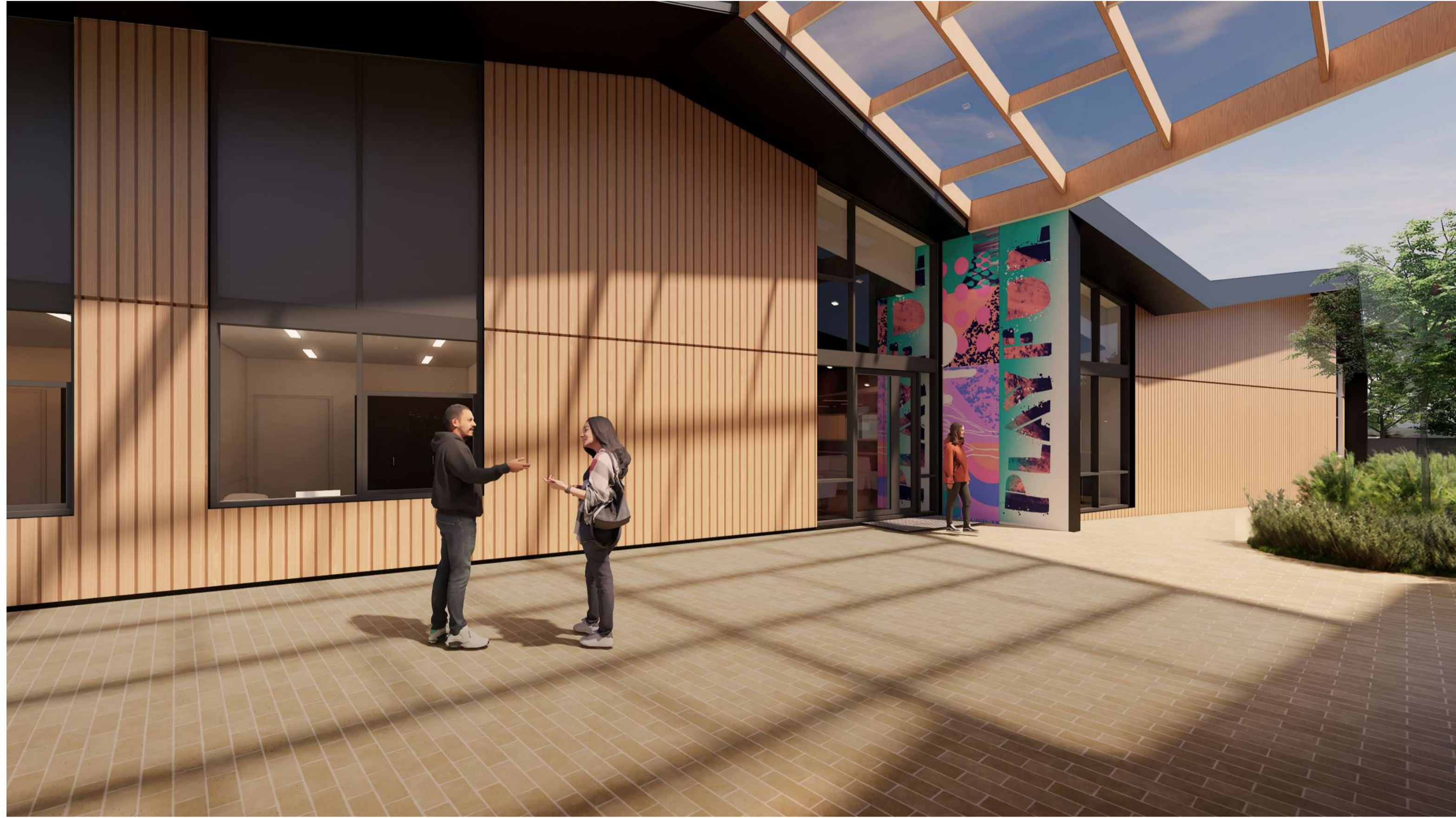
EXTERIOR PERSPECTIVE 1: ENTRY