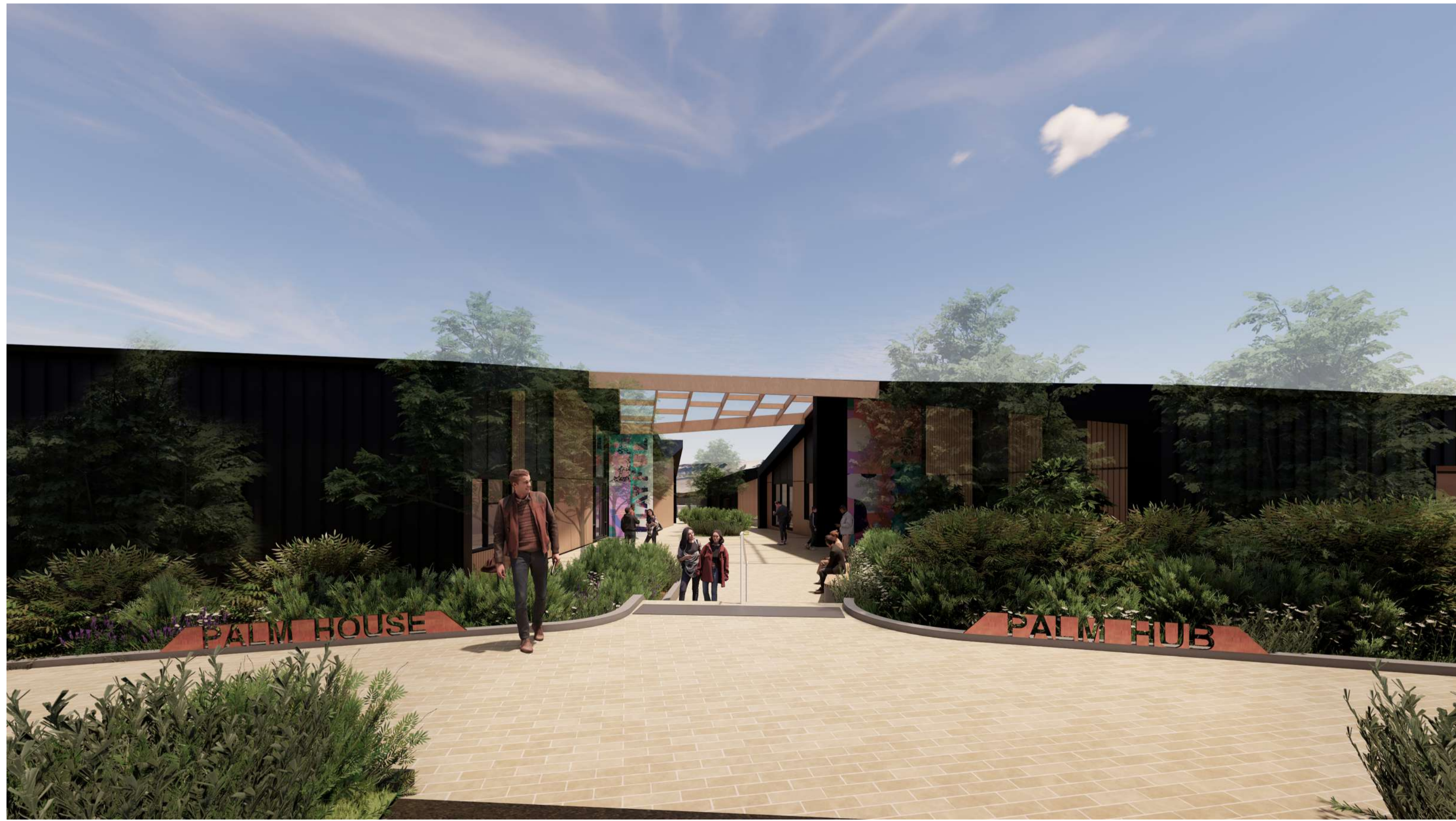
EXTERIOR PERSPECTIVE 2: THE STREET