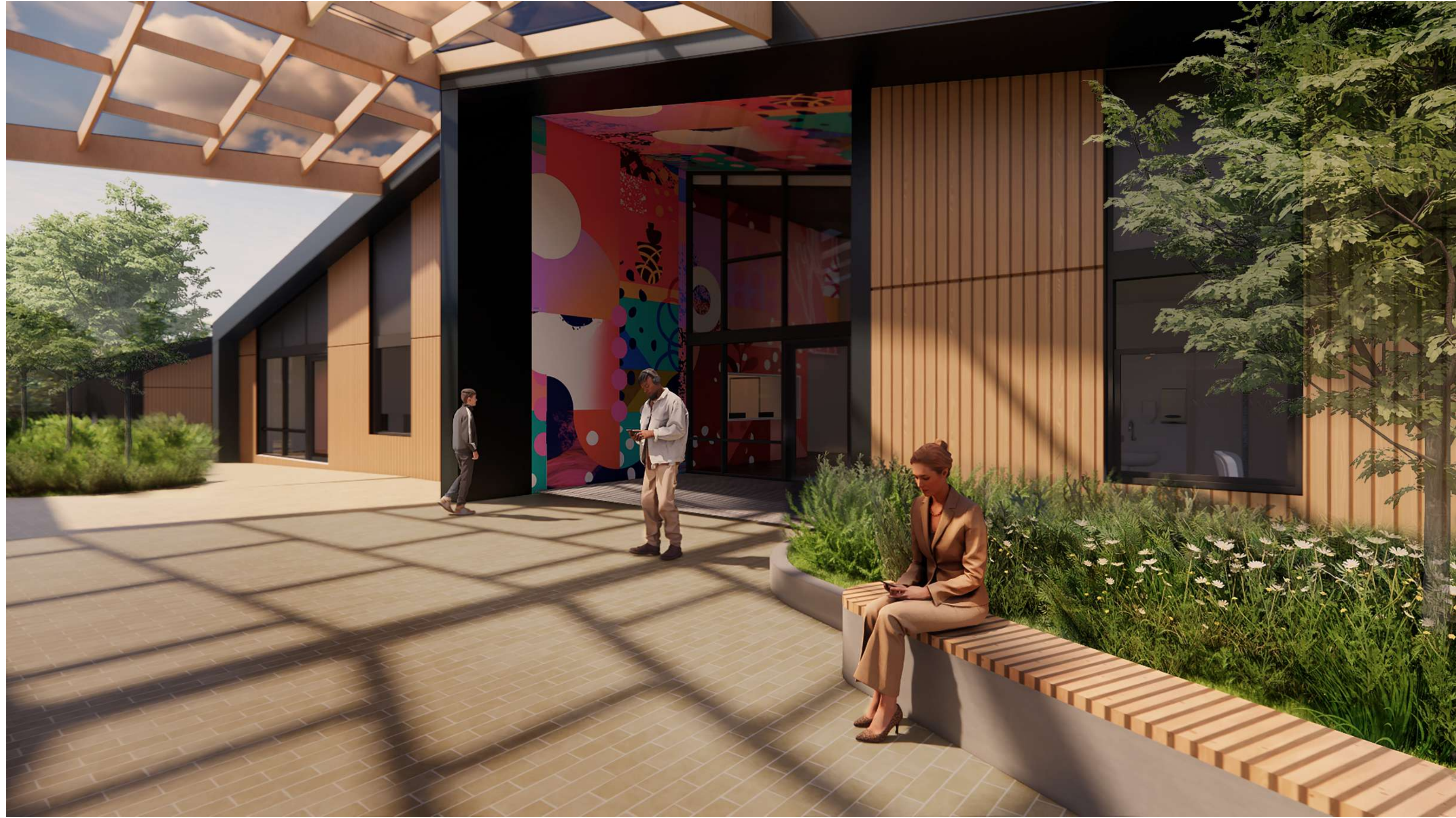
EXTERIOR PERSPECTIVE 1: PALM HUB ENTRY