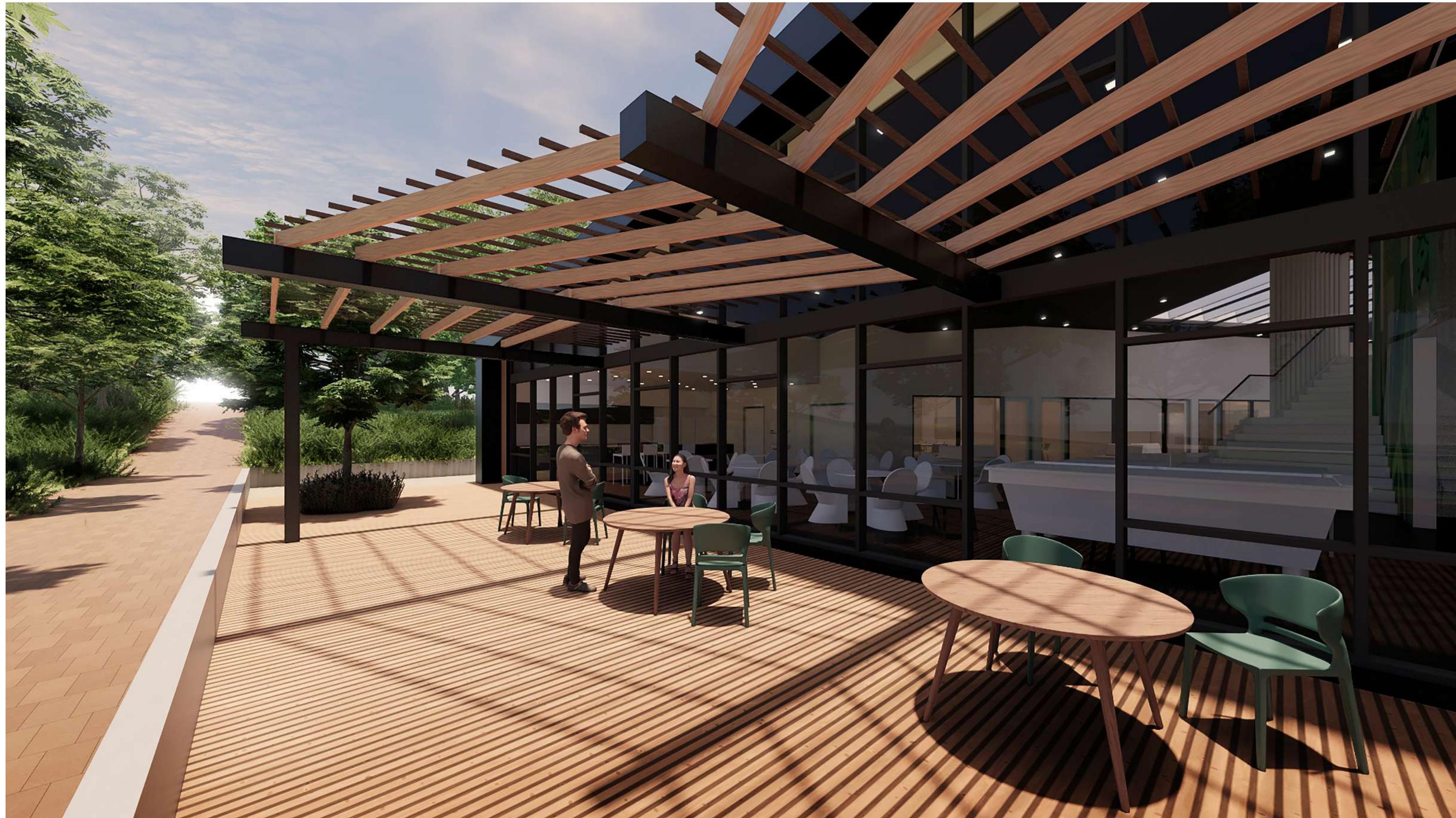
EXTERIOR PERSPECTIVE 2: PALM HUB OUTDOOR COMMUNAL AREA