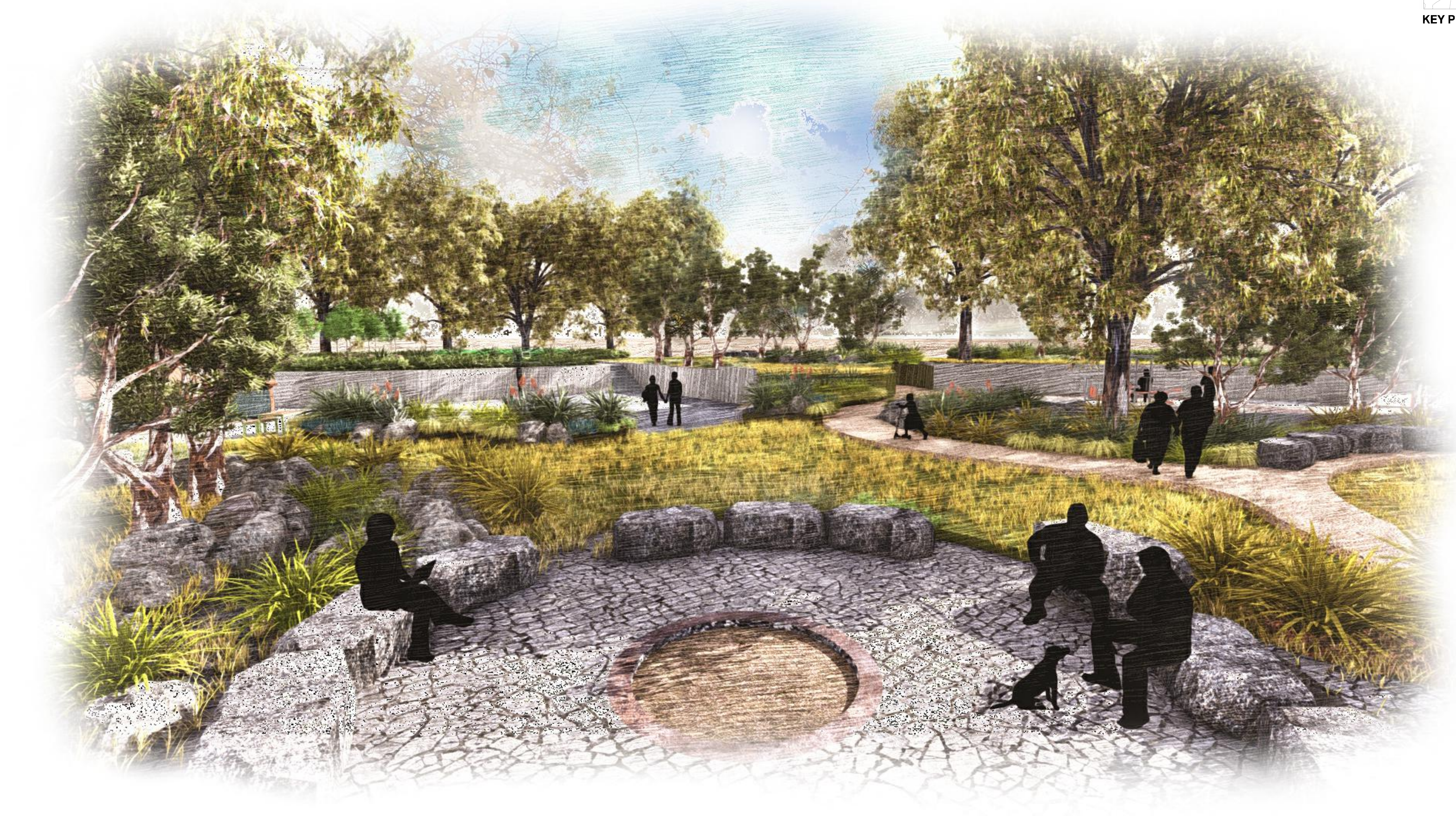
PERSPECTIVE VIEW 3 - KUP MURRI SEATING CIRCLE

LANDSCAPE ARCHITECT redbox design group 02 6280 4949 (toll) inbox@redboxdesigngroup.com.au 35 Kennedy Street, Kingston ACT 2604 PO Box 4575 Kingston ACT 2604 redboxdesigngroup.com.au