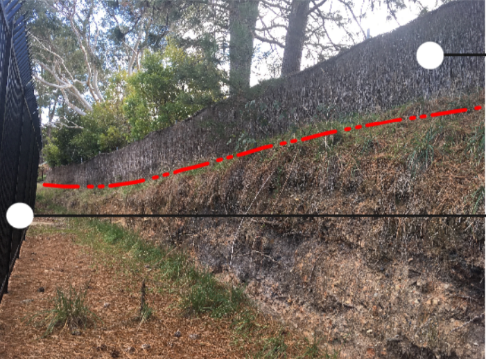
Existing private thatched fence to be retained Boundary Line