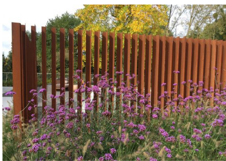
Steel Bar Fence