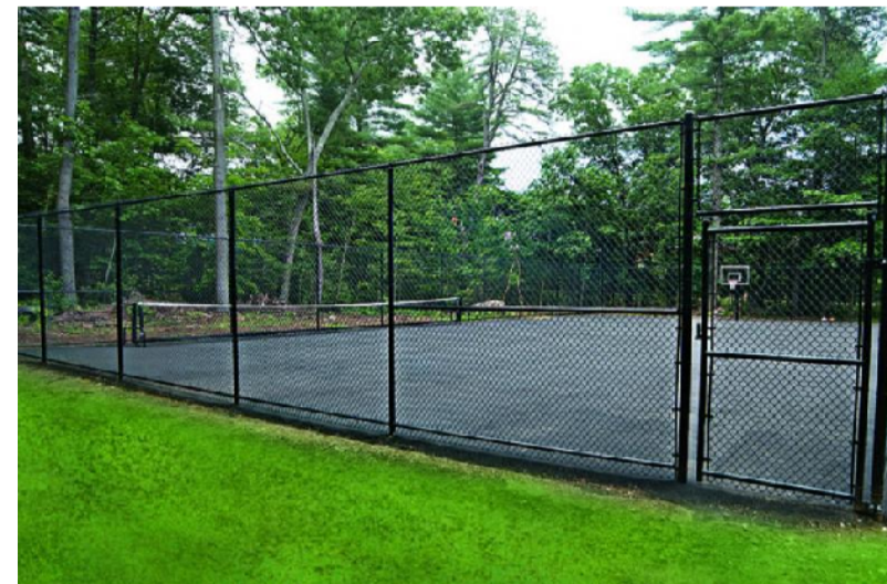
Tennis Court Fence & Entry