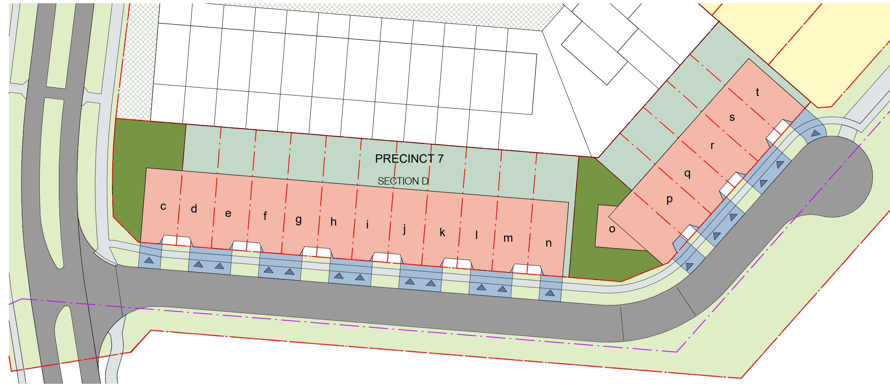
1 PRECINCT 7 - INTEGRATED HOUSING DEVELOPMENT PLAN 1 : 500@A1