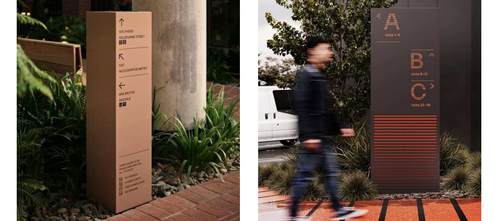
SIGNAGE TYPE 6 - TOTEM Totem integrated with landscape Non illuminated

Nominated Architects: Adam Haddow-7188 | John Pradel-7004