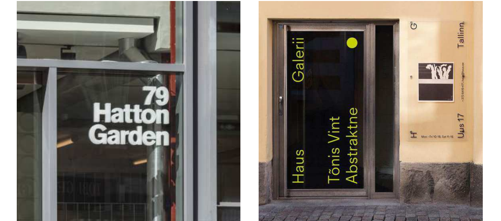
SIGNAGE TYPE 3 - GLAZING DECAL Glazing decal zone for tenancy signage Non illuminated