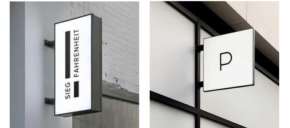
SIGNAGE TYPE 1 - LIGHT BOX Protruding metal signboard, fixed to mullion or walkway structure Signage will be illuminated