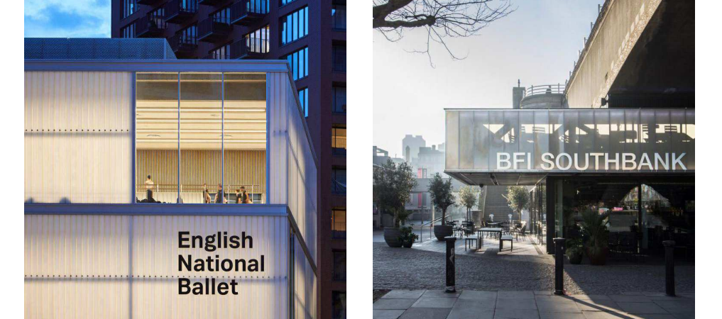
SIGNAGE TYPE 5 - EXTRUDED LETTERING Fine, metal lettering, nominal 5 - 10mm thickness Non illuminated