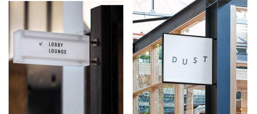
SIGNAGE TYPE 2 - AWNING SIGN Metal signboard, fixed to awning Signage will be illuminated