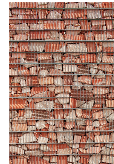
Gabion Wall (mix of site-recycled red brick and stone)