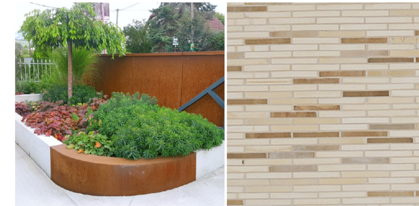
Corten Steel Cladding Concrete Planter Wall Proposed Brown Brick Wall