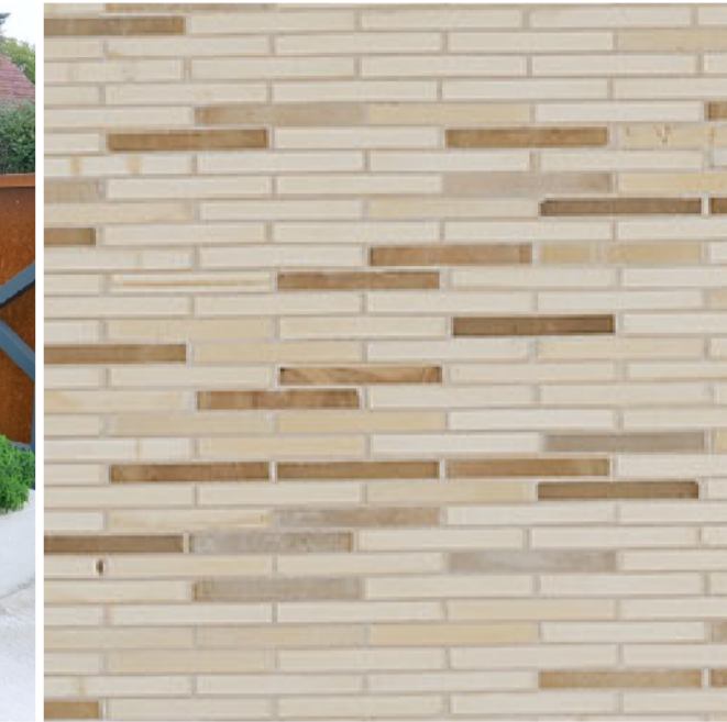
Proposed Brown Brick Wall