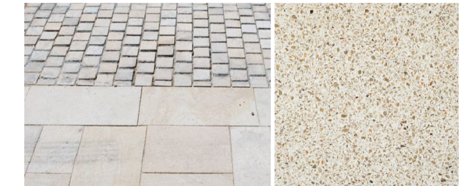
Granite Stone Paving (Internal Courtyard) Exposed Aggregate Concrete (Internal Footpath)