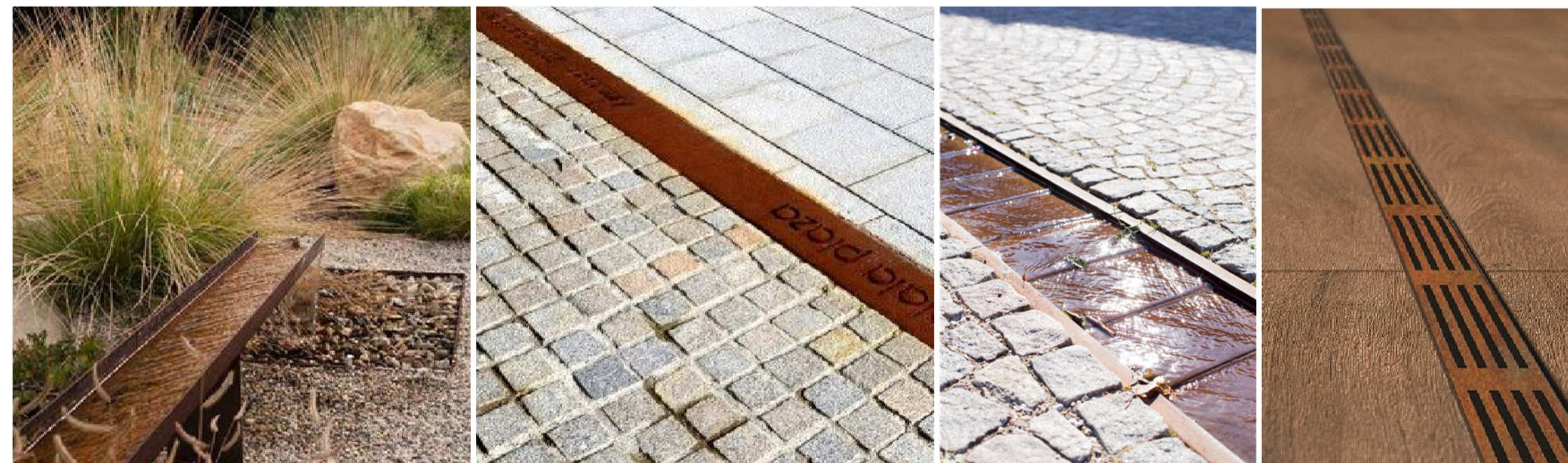
Quarry Park - Corten Water Concourse Feature Heritage Core - Corten Paving Inlay Heritage Core - Corten Water Feature Corten Steel Grated Drain