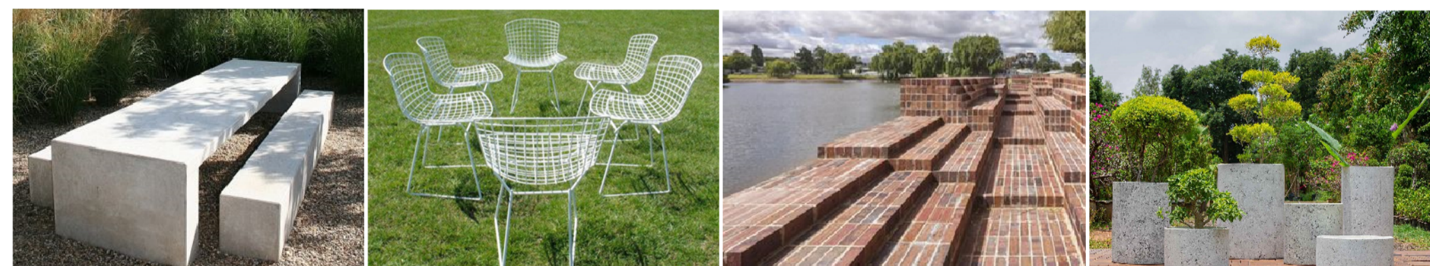
Long Table & Bench White colour loose furniture Red Brick Stacks Precinct 03 - Concrete Planter