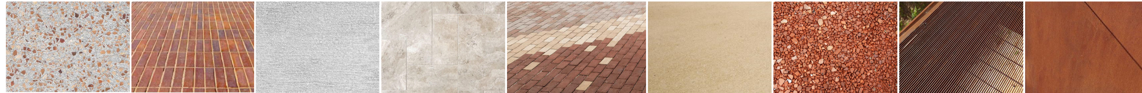
Exposed Red Aggregate Concrete Red Brick (stack bond) Concrete In Situ (Broom Finish) Light Color Stone (Pool Area) Red Brick (stitch inlay) Decomposed Granite Crushed Bricks Corten Grating Corten Edge