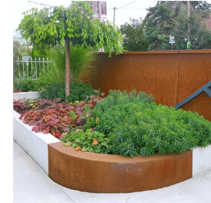
Corten Steel Cladding Concrete Planter Wall