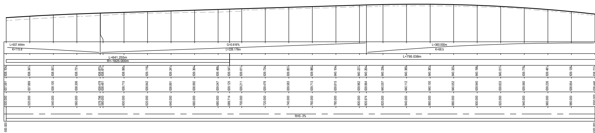
LONGITUDINAL SECTION ALONG CONTROL MC00 HORIZONTAL 1 : 1000 VERTICAL 1 : 200

DATUM R.L. 634.000 VERTICAL ALIGNMENT HORIZONTAL ALIGNMENT DESIGN LEVELS EXISTING LEVELS CHAINAGE SUPERELEVATION