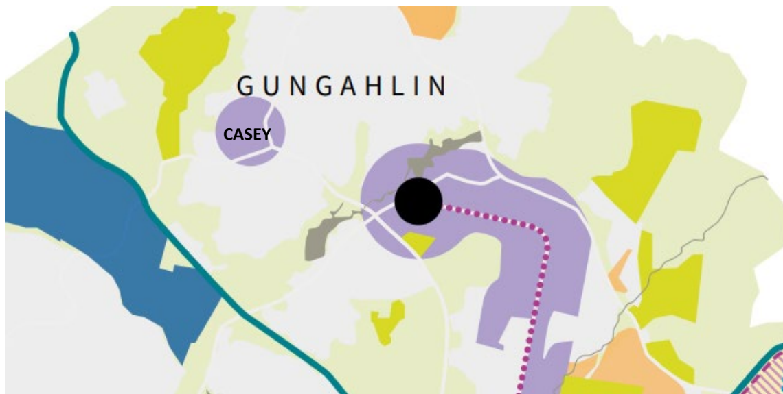
Figure 1 – Strategic Policy Plan, 2018