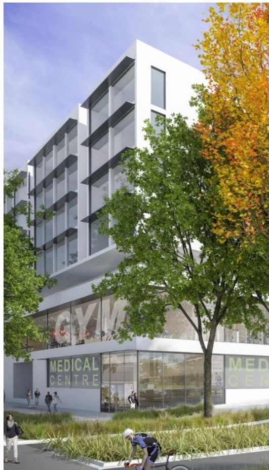
Figure 2 – ACT Government, SLA, Draft Whitlam Local Centre Design and Place Framework, June 2022.

Development of up to 4 storeys is now regularly occurring at local centres (for example Crace) and the ACT Government has flagged up to 6 storeys as being appropriate at the proposed Whitlam Local Centre in Molonglo Valley.