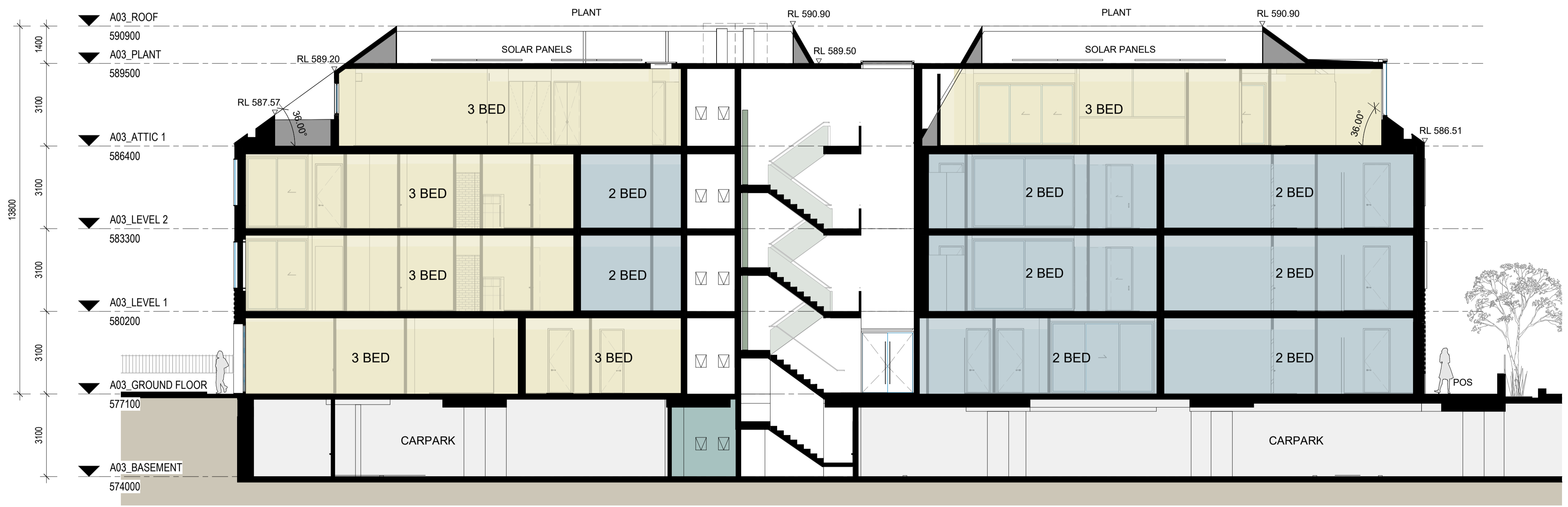
2 A03 - Section BB DA-A-0231 1:100@A1

Nominated Architects: Adam Haddow-7188 | John Pradel-7004 In accepting and utilizing this document the recipient agrees that SJB Architecture (NSW) Pty. Ltd. ACN 081 094 724 T/A SJB Architects, retain all common law, statutory law and other rights including copyright and intellectual property rights. The recipient agrees not to use this document for any purpose other than as intended; to waive all claims against SJB Architects resulting from unauthorised changes; or to reuse the document on other projects without the prior written consent of SJB Architects. Under no circumstances shall transfer of this document be deemed a sale. SJB Architects makes no warranties of fitness for any purpose. The Builder/Contractor shall verify job dimensions prior to any work commencing. Use figured dimensions only. Do not scale drawings.