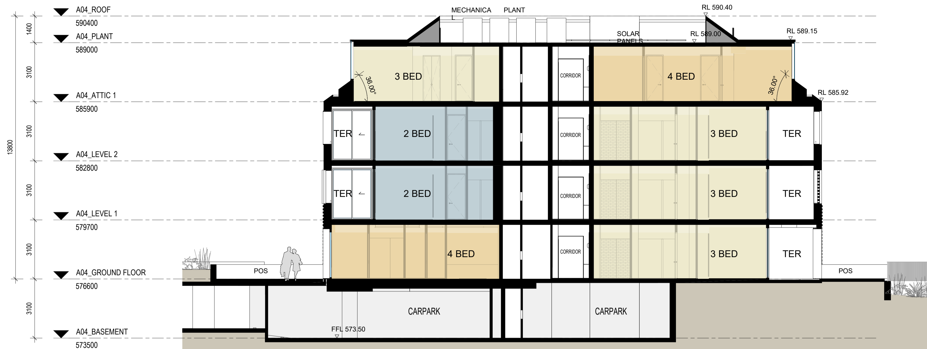
1 A04 - Section AA DA-A-0241 1: 100@A1