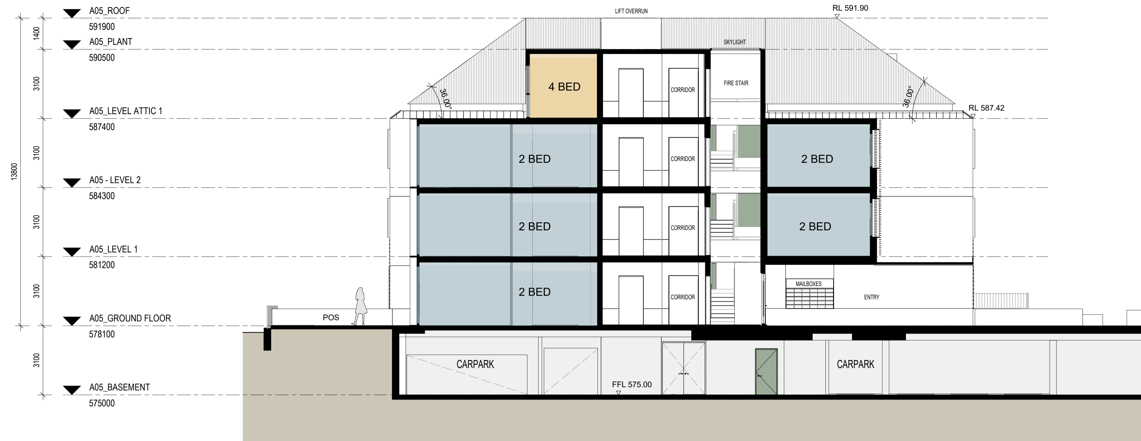
1 A05 - Section AA DA-A-025 1: 100@A1