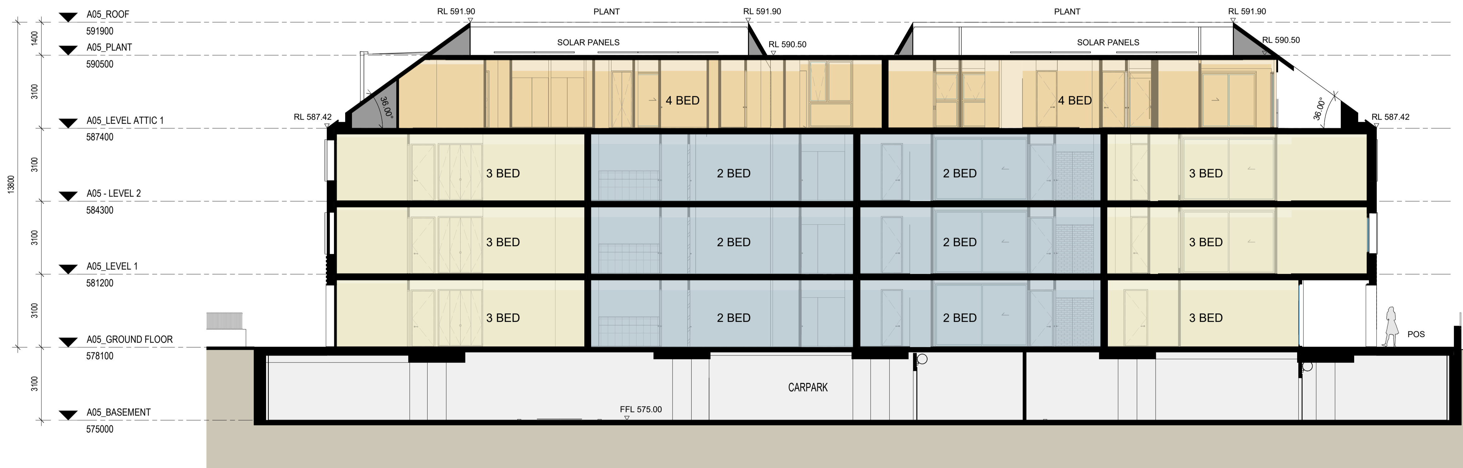
2 A05 - Section BB DA-A-025 1: 100@A1