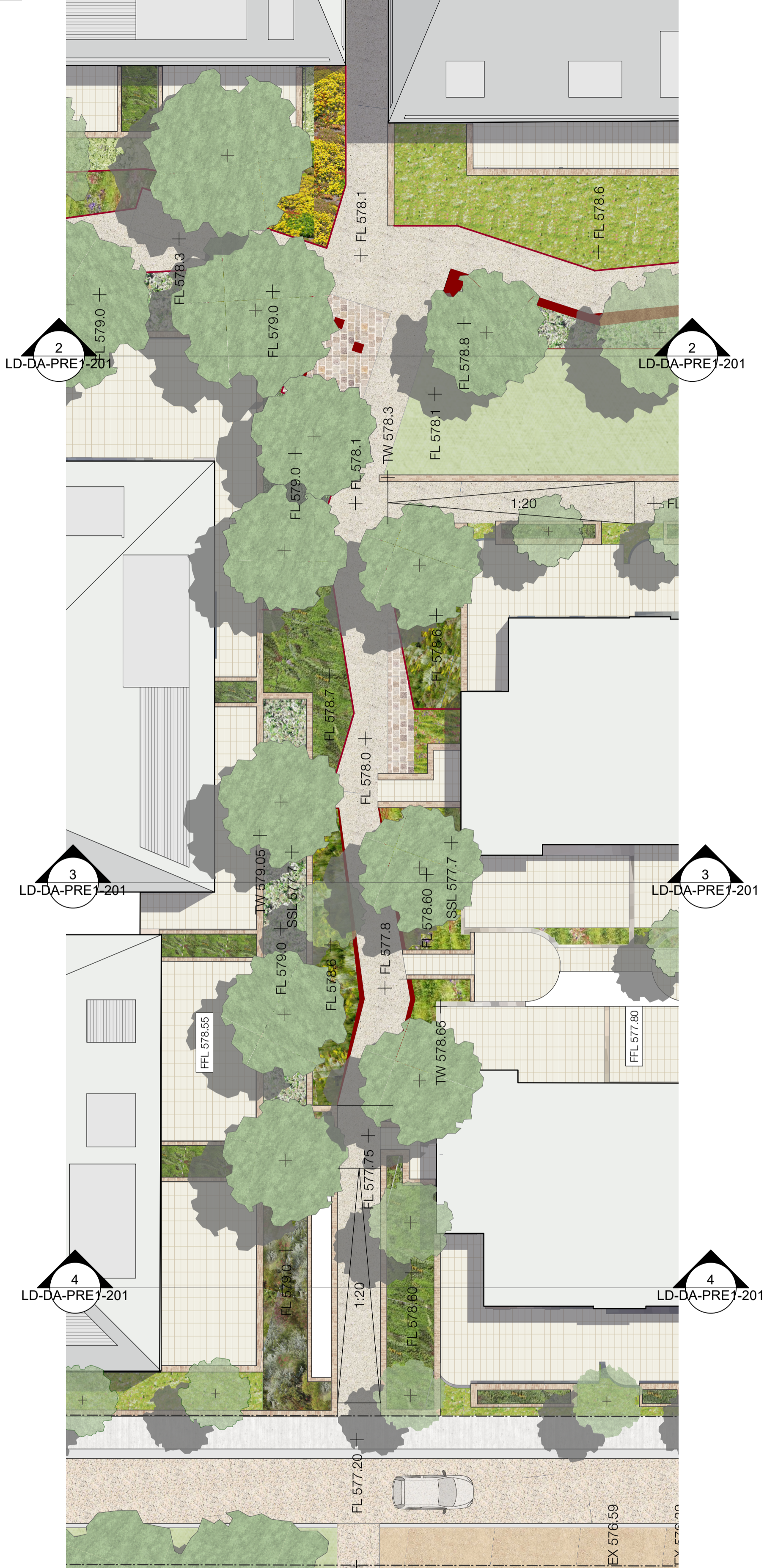
1 Corridor between A01 & A02 Plan - Scale 1:150