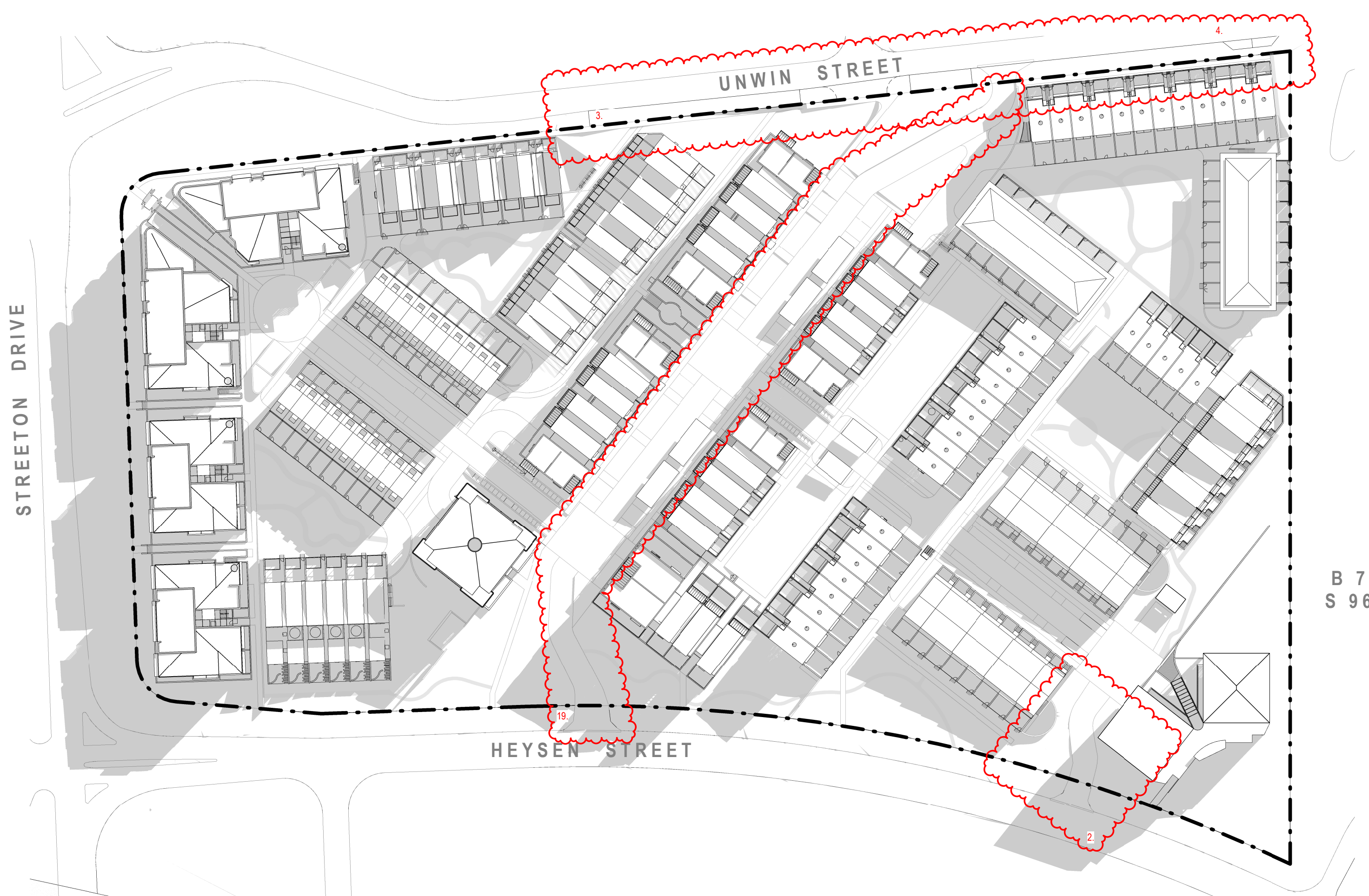
SOLAR DIAGRAMS - WINTER SOLSTICE 9am