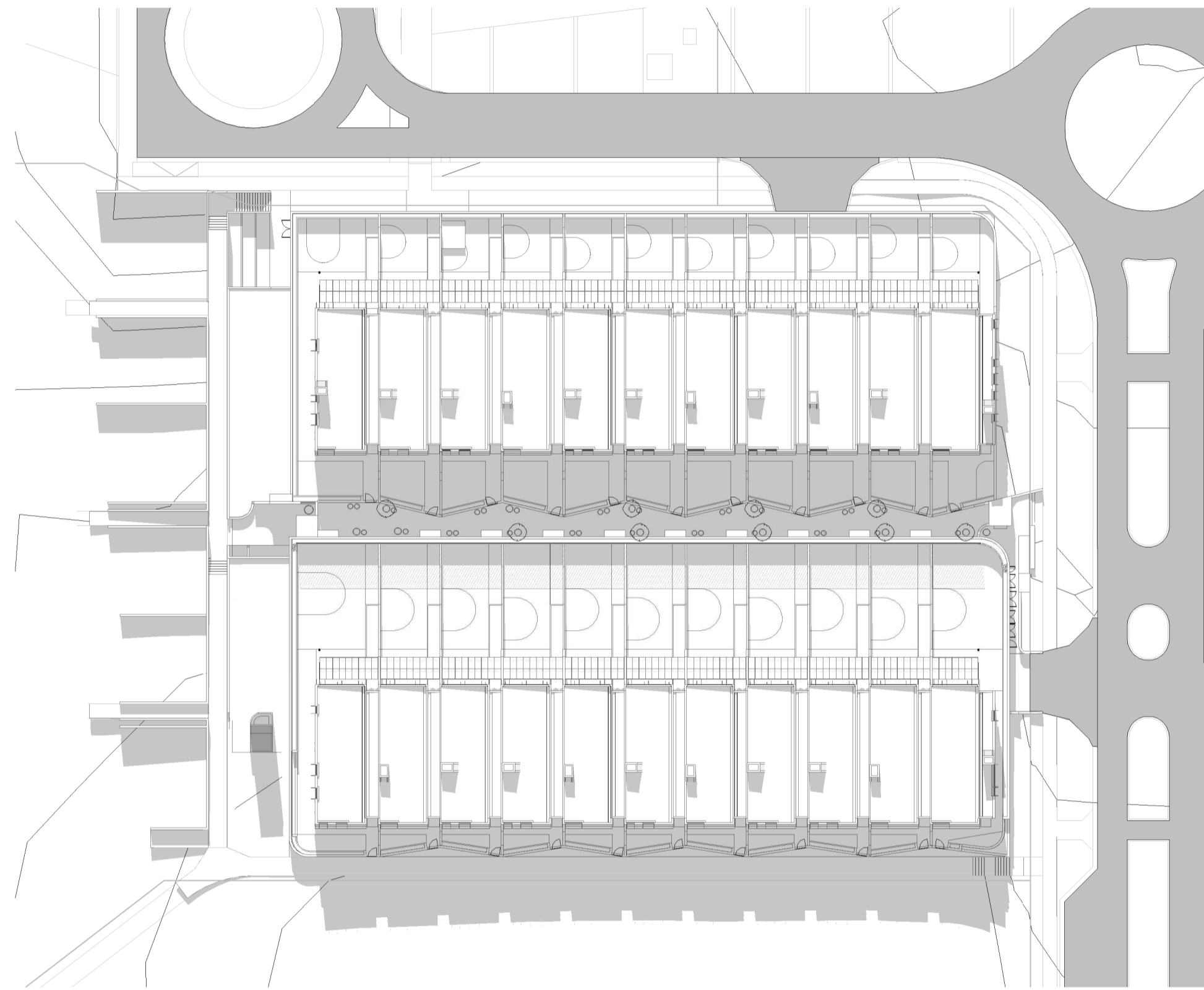
02 June 21st @12pm 1:200