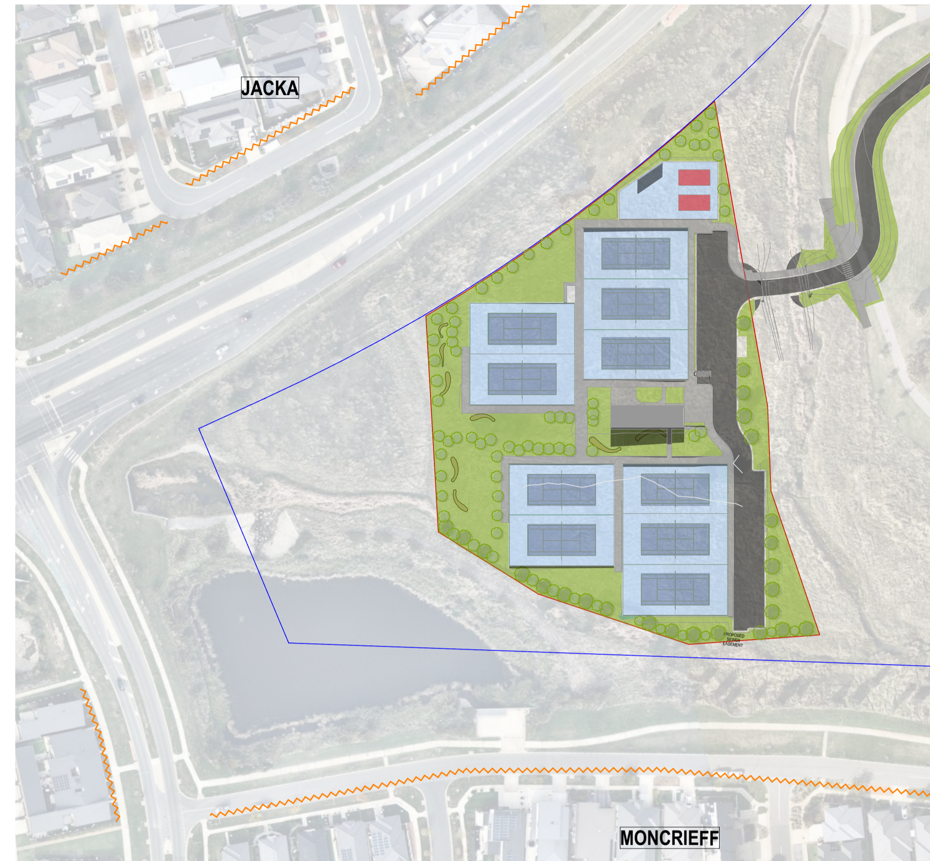
02 Shadow Study 21 June at 1200h