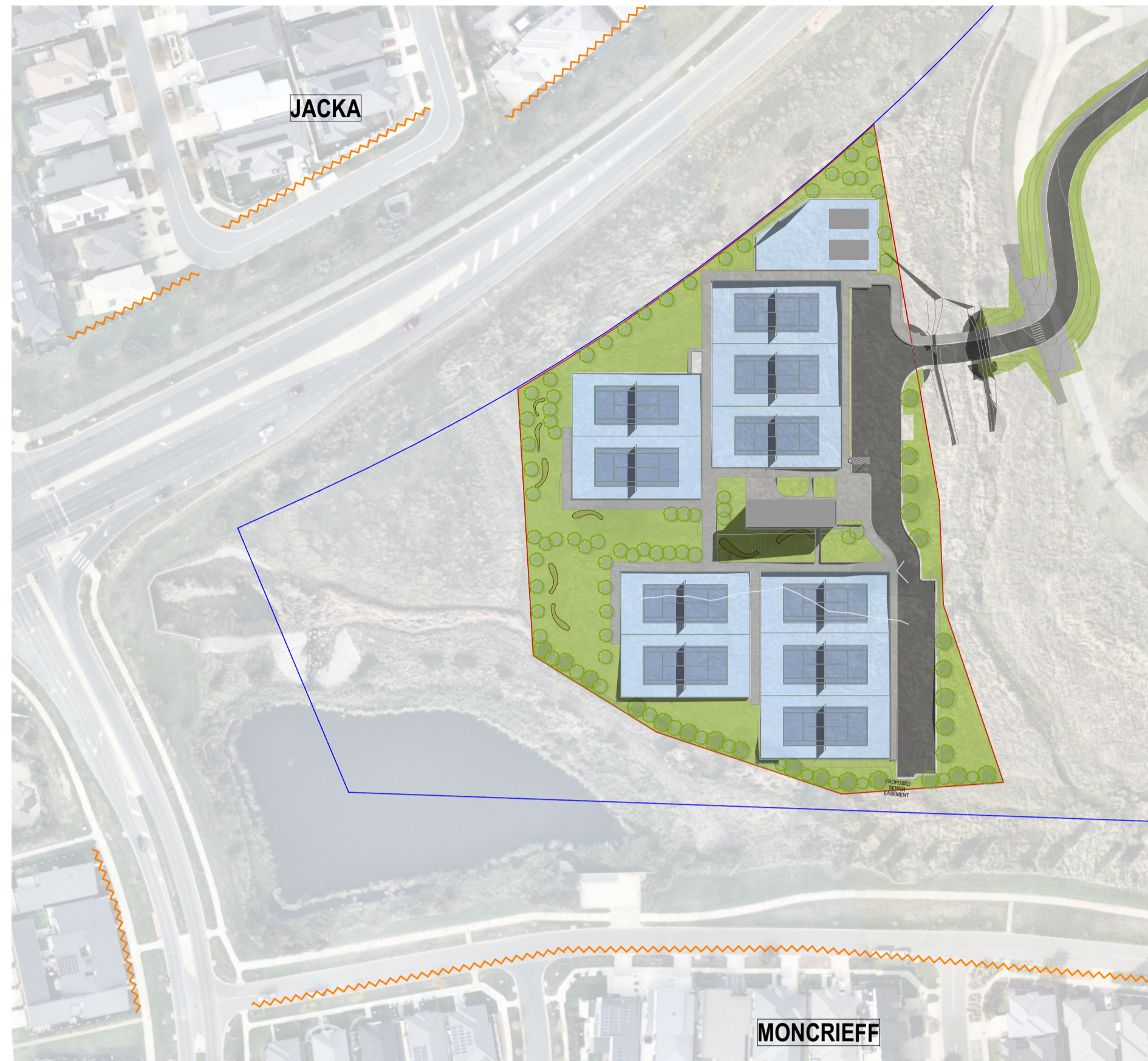
01 Shadow Study 21 June at 0900h