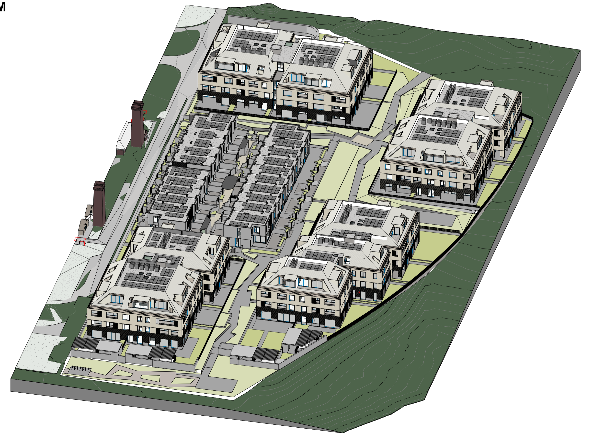
Sun View - 21-June-18 - 12:30PM