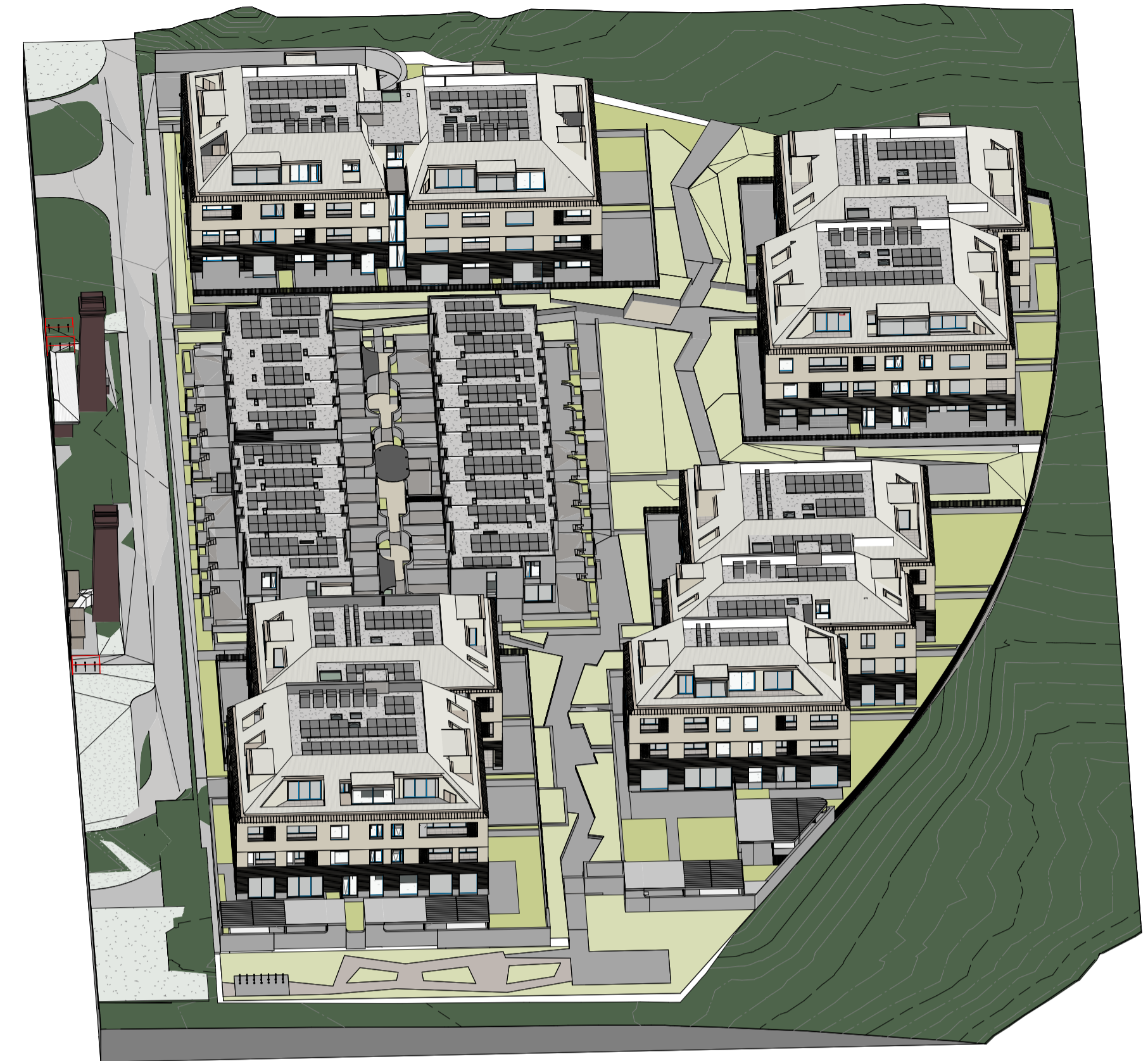
Sun View - 21-June-18 - 11:30AM