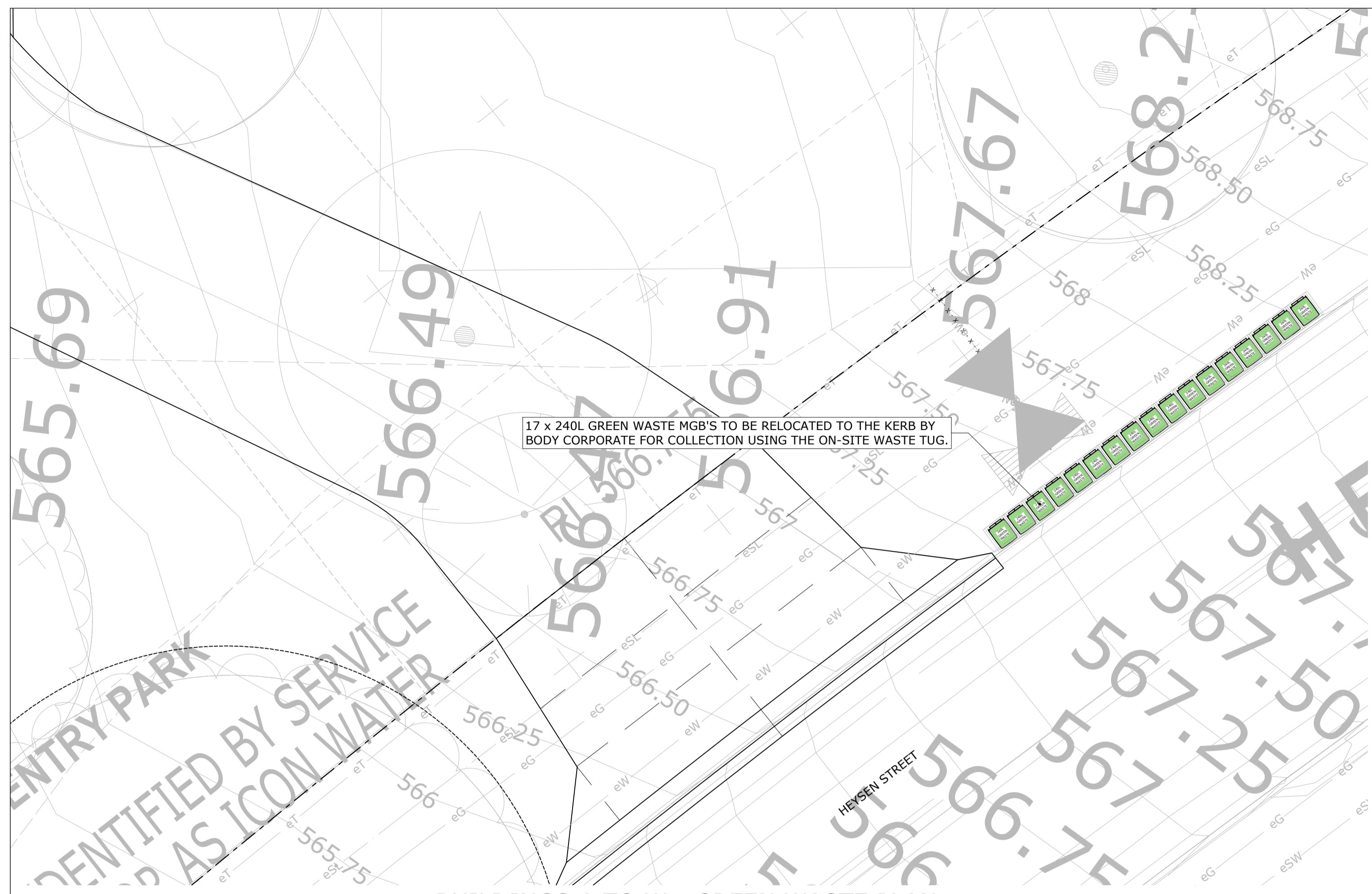
BUILDINGS A TO W - GREEN WASTE PLAN 1:100 @ A1