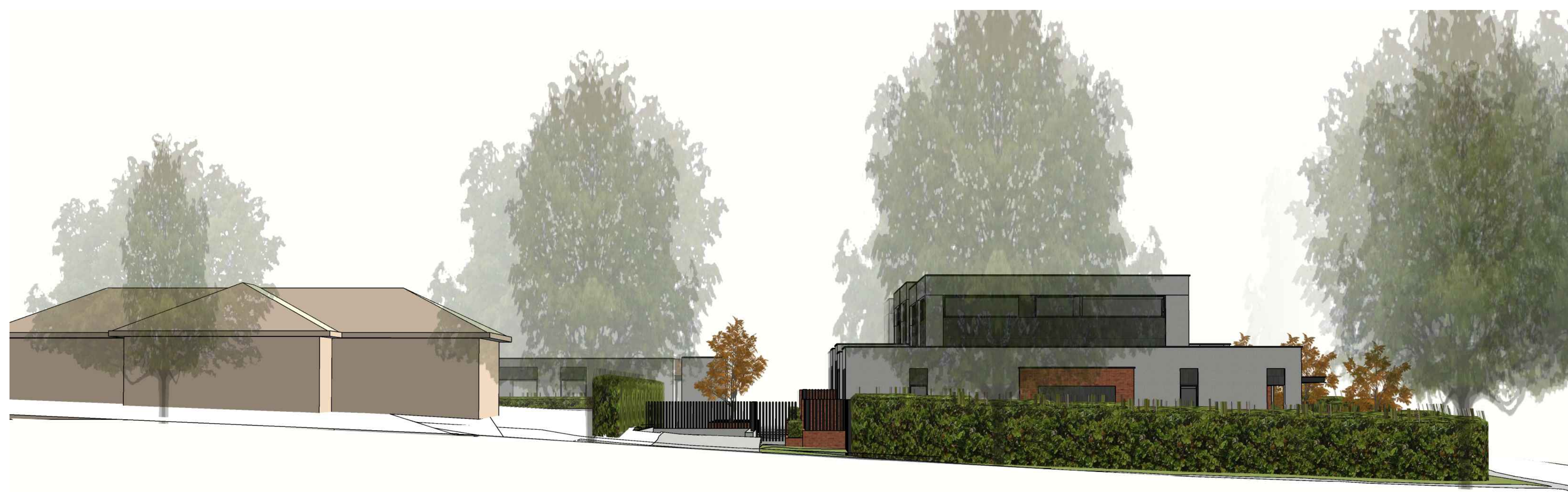
HUTCHINS STREETScape ELEVATION