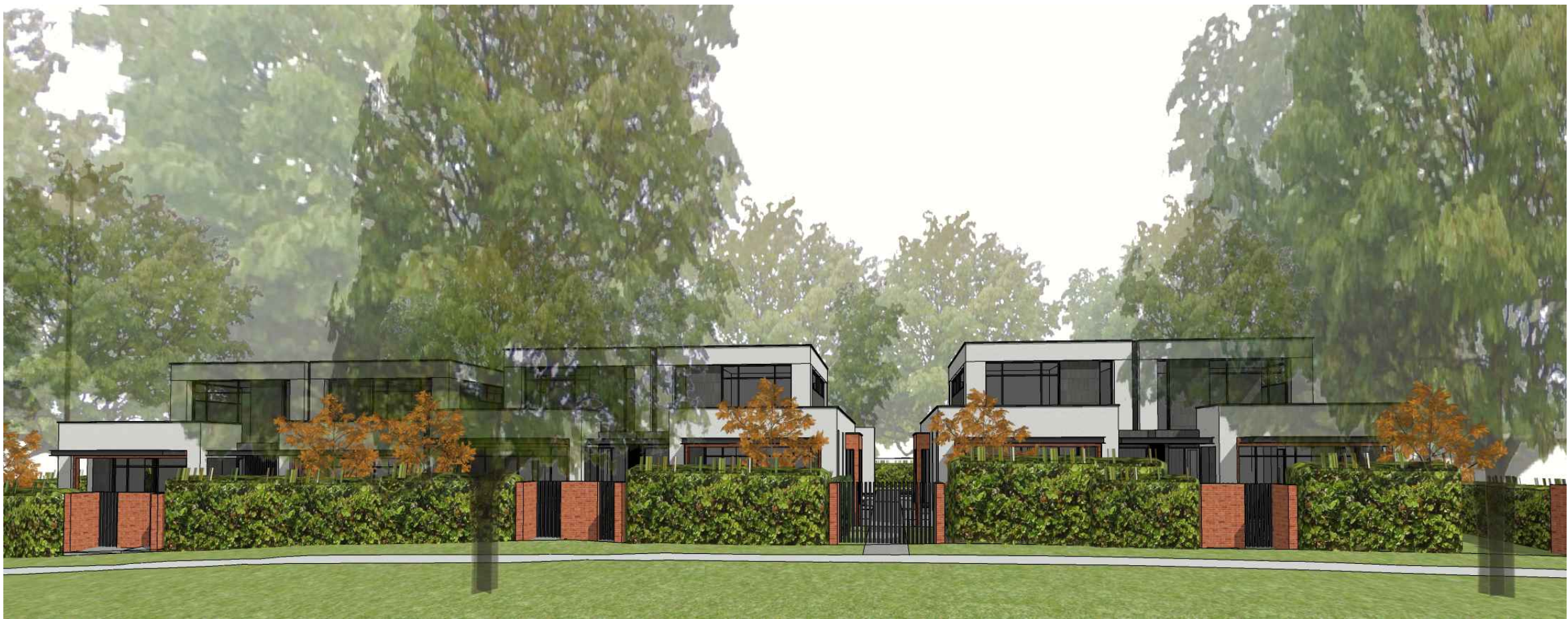
DETAIL VIEW OF TOWNHOUSE FACING HUTCHINS STREET