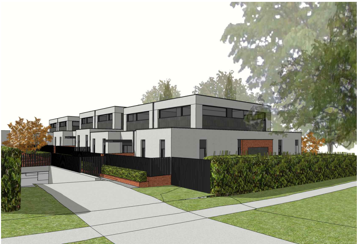
VIEW FROM BENTHAM STREET FACING WEST ELEVATION