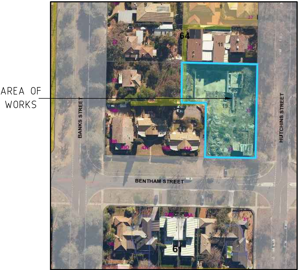
LOCATION PLAN NOT TO SCALE