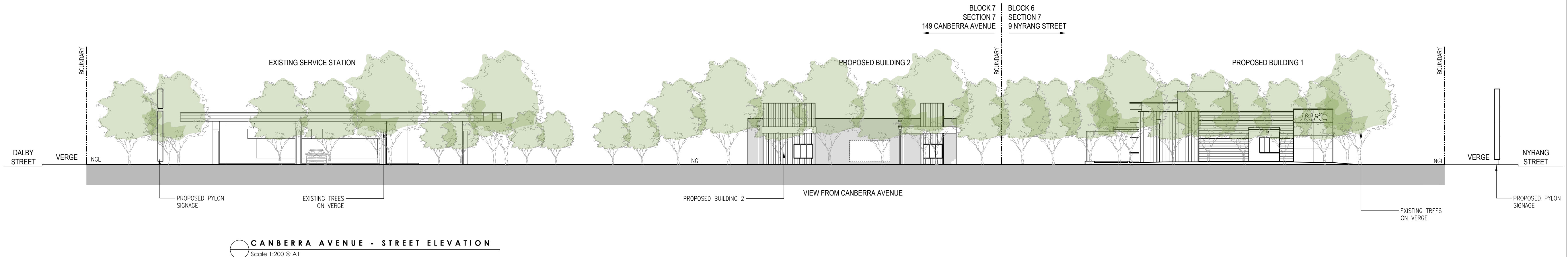
CANBERRA AVENUE - STREET ELEVATION Scale 1:200 @ A1