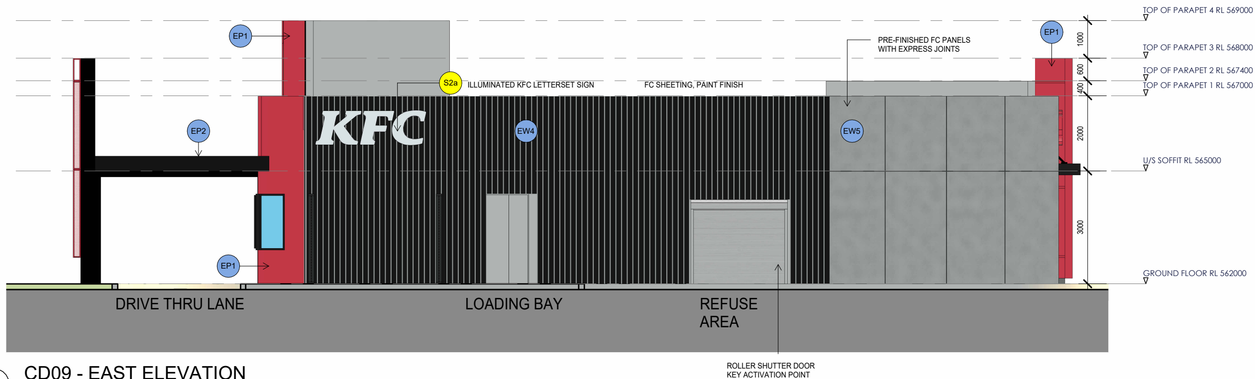
2 CD09 - EAST ELEVATION 1 : 100