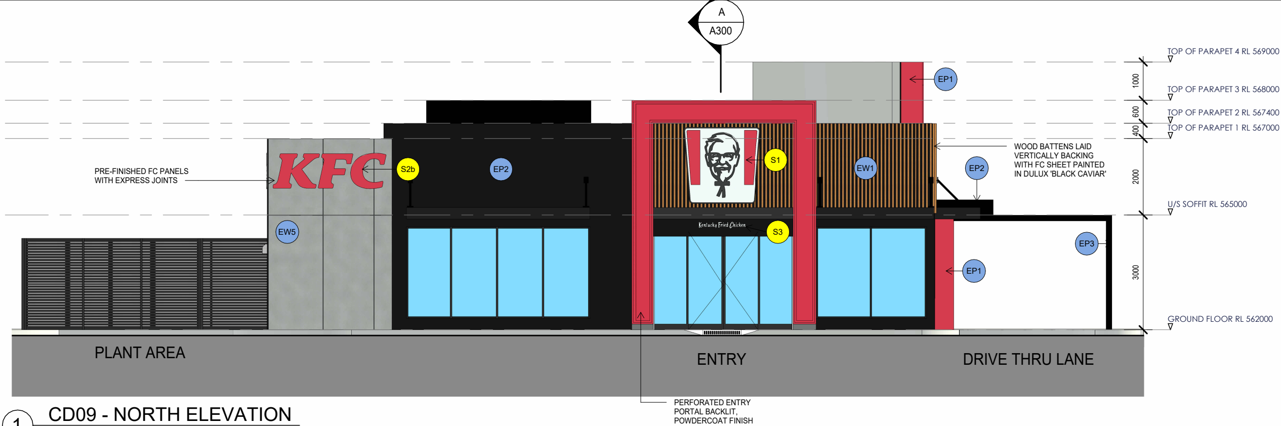
1 CD09 - NORTH ELEVATION 1 : 100