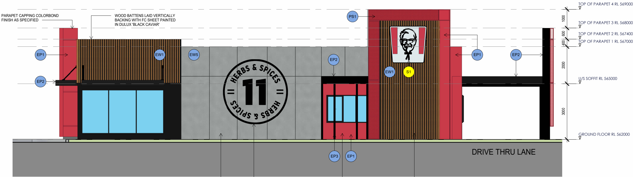
1 CD09 - WEST ELEVATION 1 : 100