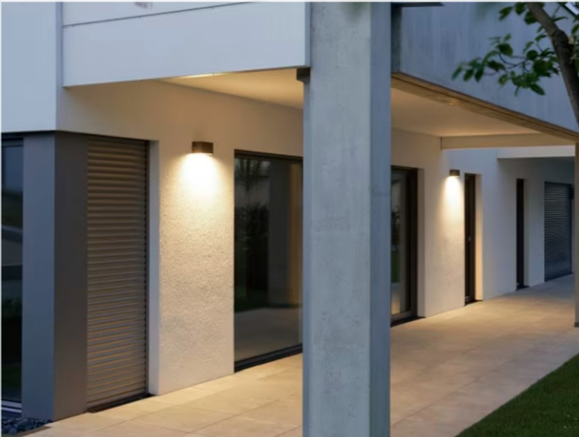
W1 & W4 - WALL LIGHT FOR GENERAL LIGHTING