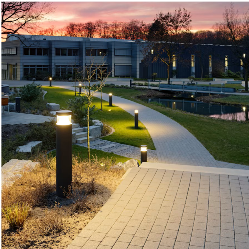
BL1 - LED BOLLARD LIGHTS FOR PATHWAY ILLUMINATION