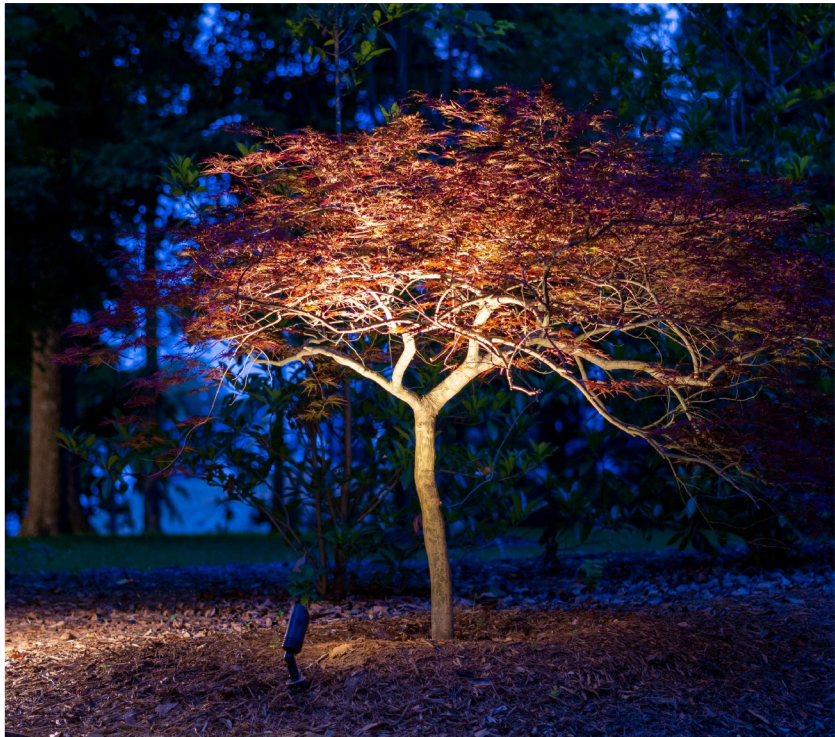
K2 - FEATURE UPLIGHTING - TREES