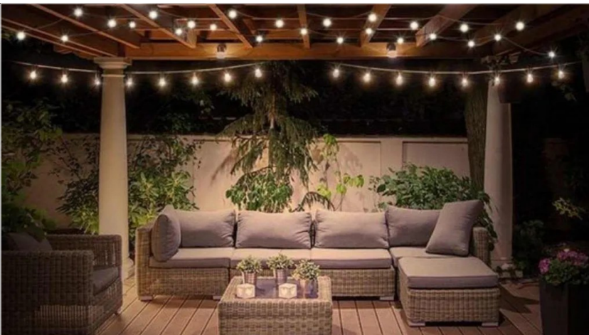
F1 - FESTOON LIGHTING TO PERGOLA STRUCTURE