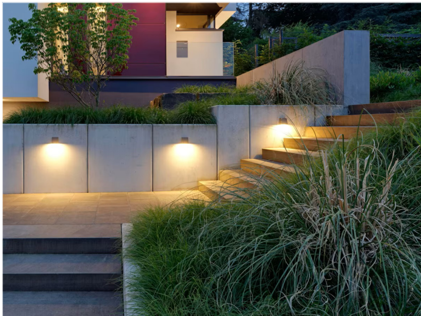
W2 - LOW MOUNTED WALL LIGHT FOR PATHWAY ILLUMINATION