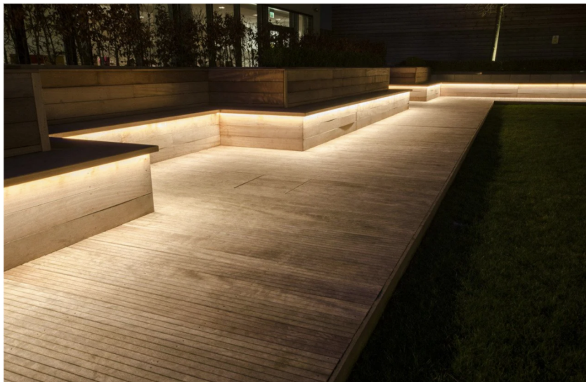
L1 - LED STRIP TO BENCH SEAT FEATURE LIGHTING