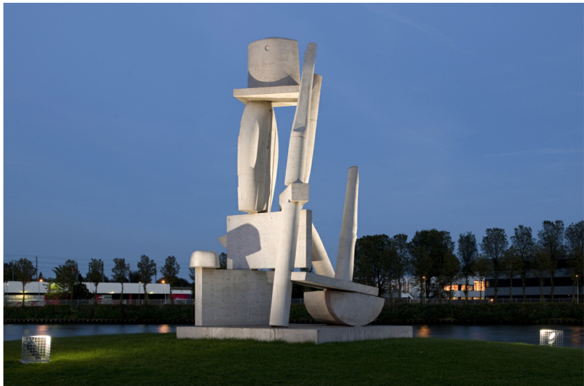
K1 - FEATURE UPLIGHTING - ARTWORK