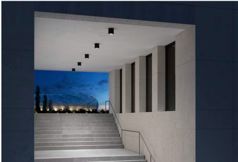
C1 & C2 - SURFACE MOUNTED DOWNLIGHT TO UNDERSIDE OF AWNING