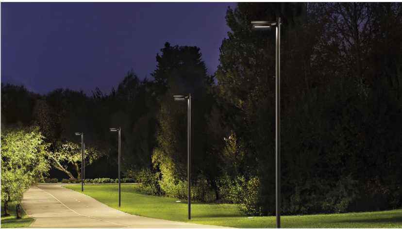
PL1 - LANEWAY STREELIGHT POLE LIGHTS