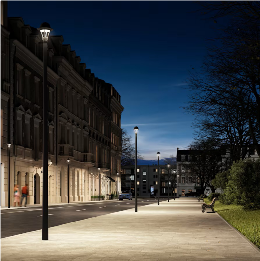
PL2 - PEDESTRIAN POLE LIGHTS FOR GENERAL LIGHTING